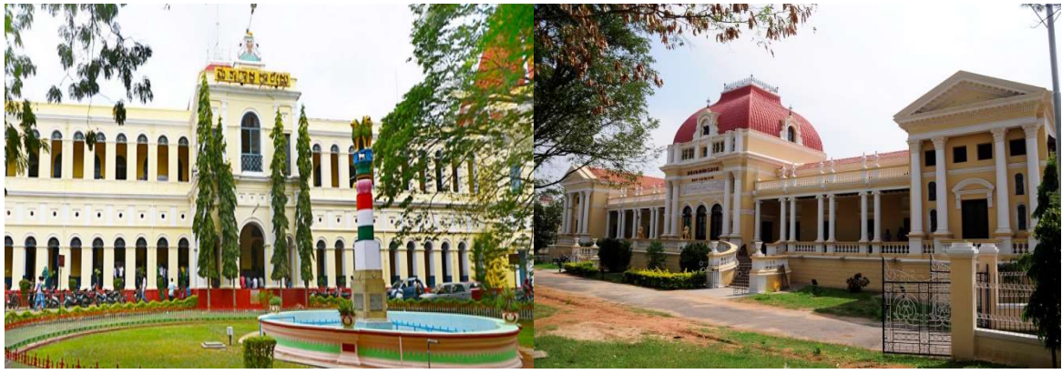
Maharaja's College (1889)