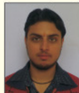
Gagan 72.5% (ECE)