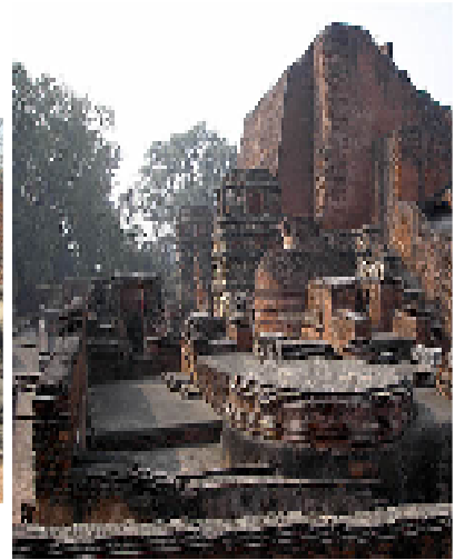
Sariputra's stupa with remains of other stupas