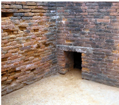
Naropa's cell and entrance to meditation cell