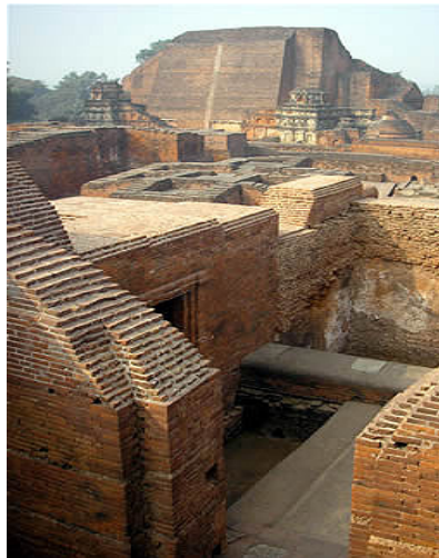
part of the ancient university