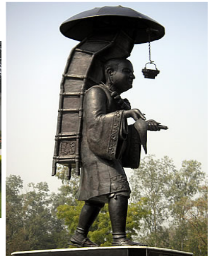
statue of Hsuan Tsang