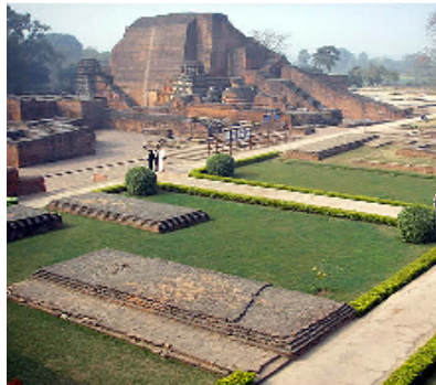
general overview of part of the site