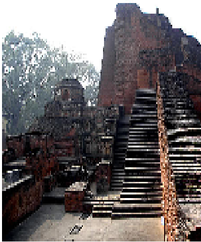
staircase up Sariputra's stupa