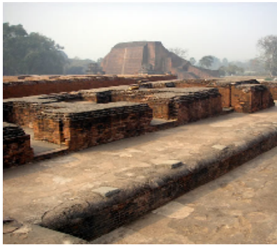
ruins of the university

Bakhtiyar Khalji sacked the university. It was in the 1860's that the great archeologist Alexander Cunningham identified the site as the Nalanda University and in 1915-1916 the Archeological Survey of India began excavations of the site. What has been excavated to date is only a small part of the entire site but much of the ruins are beneath existing villages and are unlikely to be revealed. The present site is well-maintained and very pleasant to visit. Across the street is the small museum with some excellent Buddhist statues and about a kilometer away is a temple dedicated to Hsuan Tsang. Nearby are the International Centre for Buddhist Studies and the Nava Nalanda Mahavihara, set up for the research of Buddhism.