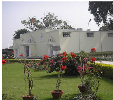
the museum at Nalanda