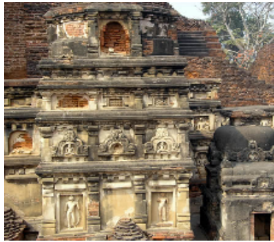
detail of Sariputra's stupa