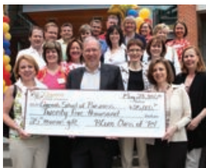
BCom'84s present their class gift at their May 2009 reunion