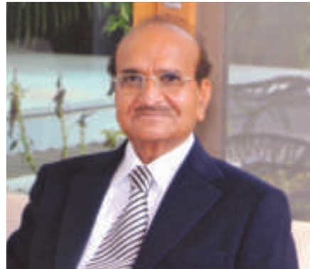
Dr. Karsanbhai K. Patel President

The Institute of Managements draws much of its inspiration and strength from its founder, Dr Karsanbhai K. Patel, Chairman, Nirma Ltd. Dr Patel was conferred with Padma Shri for 2010. He is also the recipient of the Udyog Ratna Award, Gujarat Businessman Award-1998, Ernst & Young Lifetime Achievement Award-2006, Sardar Vallabhbhai Patel Vishwa Pratibha Award-2009 and The Baroda Sun Lifetime Achievement Award 2009. He is best known for his contributions to industrial development in the country.