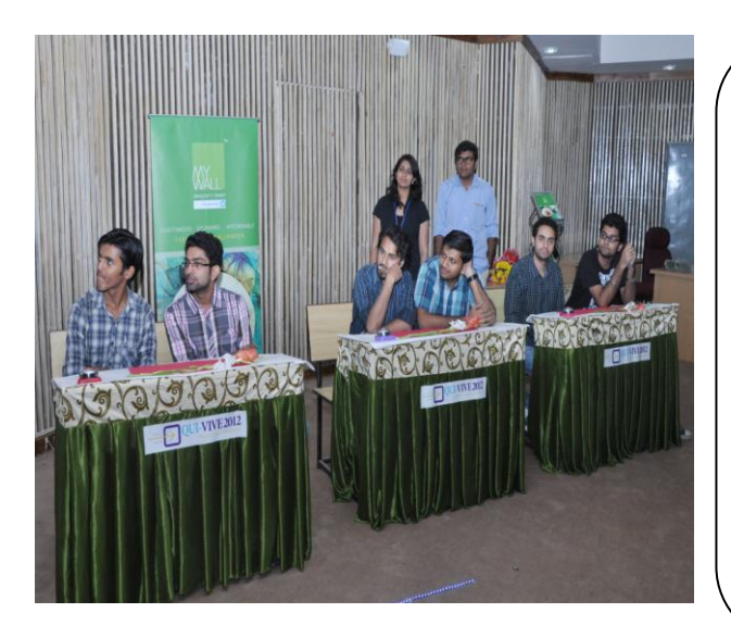
Annual National Quiz Competition, Qui-Vive 2012

The two-year (Full Time) MBA Program is designed in four semesters using participative pedagogy with equal emphasis on conceptual knowledge and application of such knowledge in industry context. The Program will present you a pool of talent focused on effective managerial leadership. Our MBA graduates has both functional specialization and technical specializations.