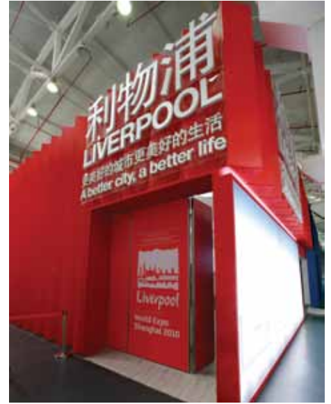
Shanghai Expo 2010