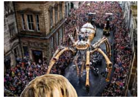
La Machine - part of the European Capital of Culture celebrations 2008