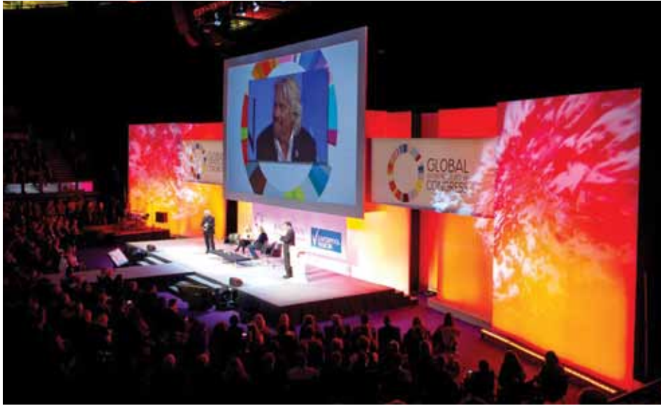
The Global Entrepreneur Congress 2012