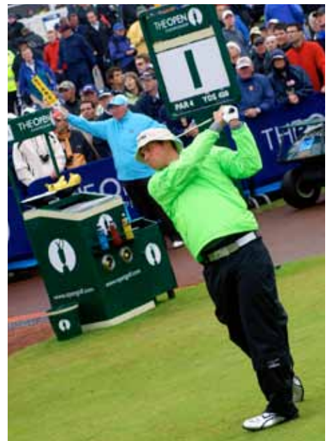
The British Open Golf Championship

Few cities are better placed to host the first multi-million pound 'International festival of Business – North' than Liverpool