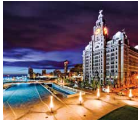
The Liverpool waterfront

This festival provides the opportunity to promote our vision that the Mersey once again becomes a key global trading centre. It will showcase the Enterprise Zones in the city region and inspire businesses in the North to connect to global growth markets and get exporting.