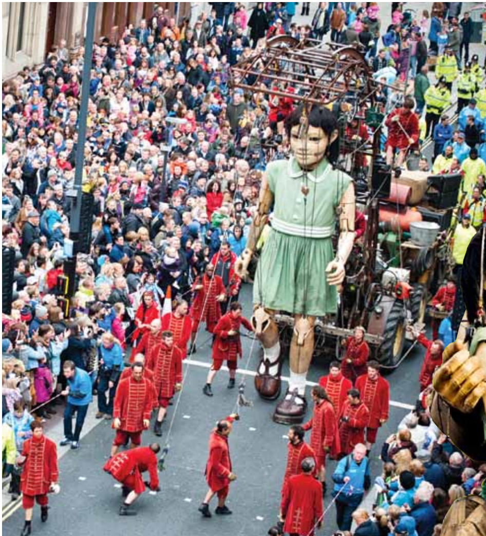
Sea Odyssey Giant Spectacular - April 2012