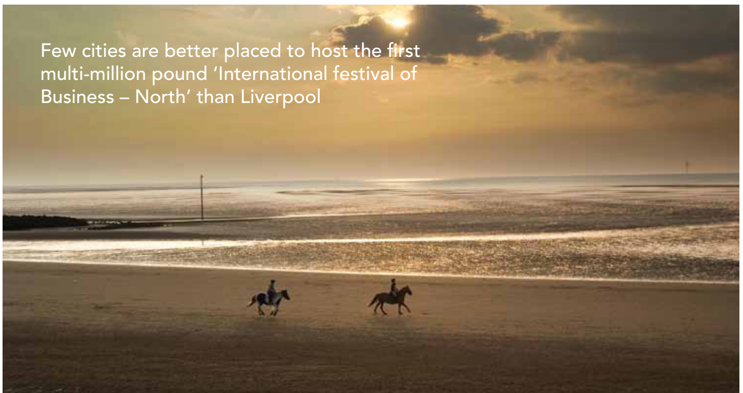
North Wirral Coastal Park

Few cities are better placed to host the first multi-million pound 'International festival of Business – North' than Liverpool