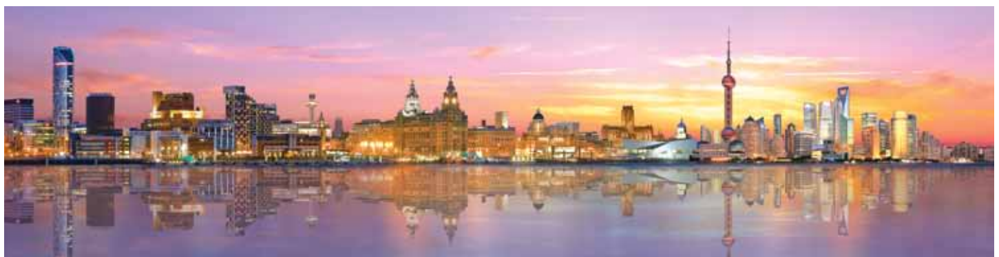
Merged Liverpool - Shanghai skyline