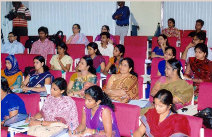
Participants in the one day Seminar on "Criminal Justice System in India : Basic Functionaries & Procedures"