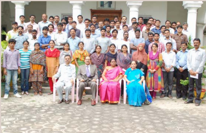
Participants of PG Diploma in Project Management