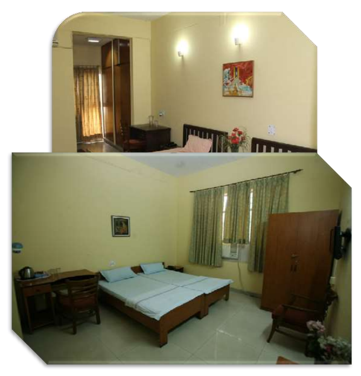
<u>Rooms</u> equipped with LCD T.V,refrigerator,Almirah,Computer table, <u>A/C,Telephone facility,Kettle etc</u>