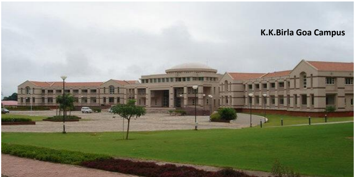
K.K.Birla Goa Campus