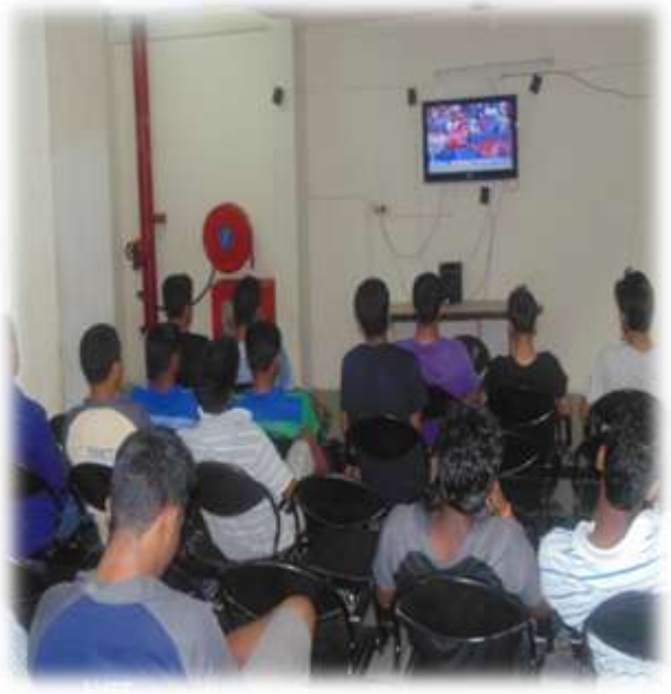
READING HALLTELEVISION HALL