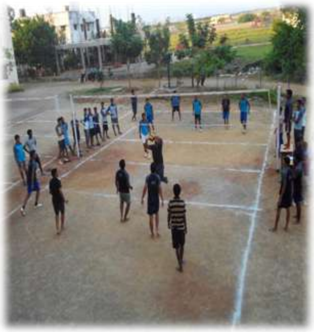
SWIMMING POOLVOLLEY BALL COURT