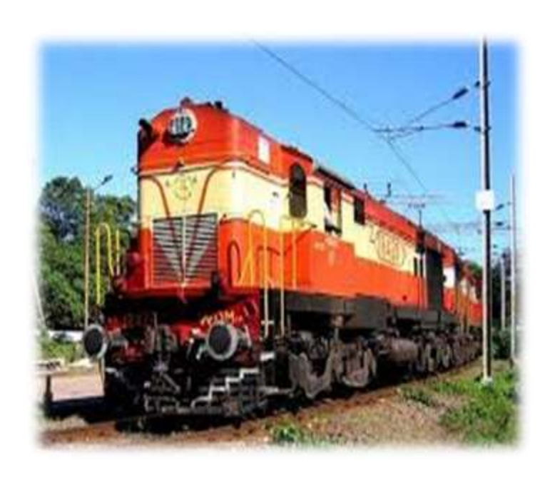
TRAIN TRAVEL CONCESSION