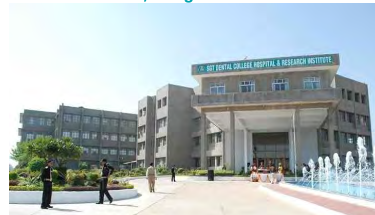
Administrative and Academic Block

The foundation of Shree Govind Tricentenary Dental College was laid in August 2000, with the avowed objective of following and spreading the message of Sri Guru Gobind Singh, according to whom the highest service to mankind is through spread of knowledge and skills. The management of the college, therefore, aims to achieve academic excellence and provide health care facilities to all through this institution. The first academic session of the college commenced from 2002-03.