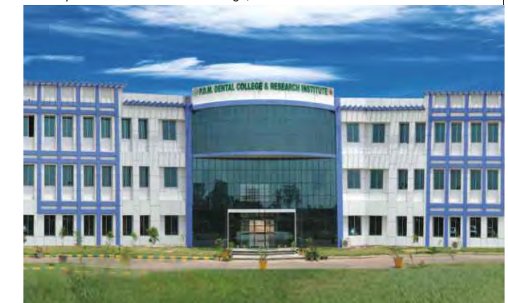
PDM Dental College & Research Institute, Bahadurgarh.

In the Academic Session 2009-10 In the State of Haryana