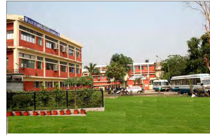
J.N. Kapoor DAV (C) Dental College, Yamuna Nagar.