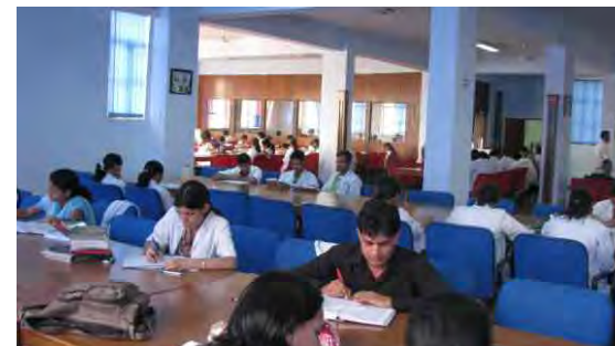
Students in Library

This is a child friendly department which has an ambience to relax a child. It deals with all diseases of teeth in children. The pedodontic faculty ensures lot of comfort to the children.