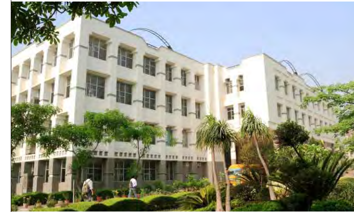
Sudha Rustagi College of Dental Sciences & Research, Faridabad.