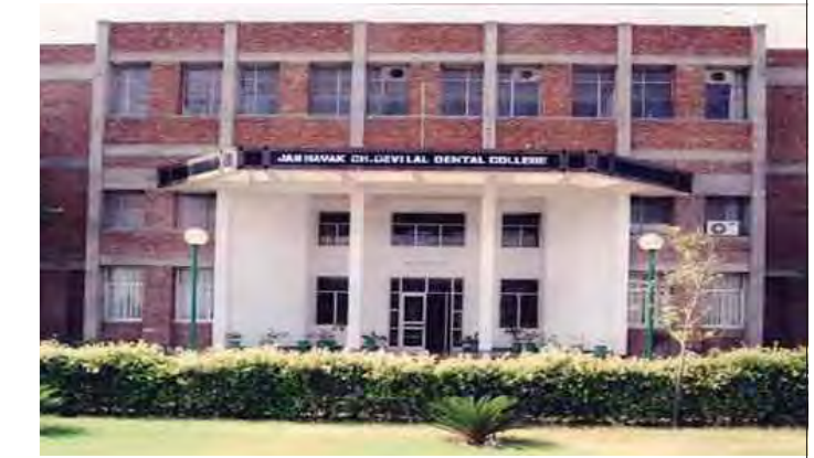
Jan Nayak Ch. Devi Lal Dental College, Sirsa.