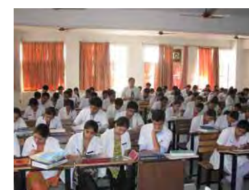
Class in Progress

The college engages services of eminent professors in the field of dentistry to impart quality education and technical skills to students. Each and every department is having its own individual audio-visual seminar room and latest equipments required. The clinical material (patients) is abundantly made available by the management through their innovative free transport service which gives students an opportunity to put their skills into practice.