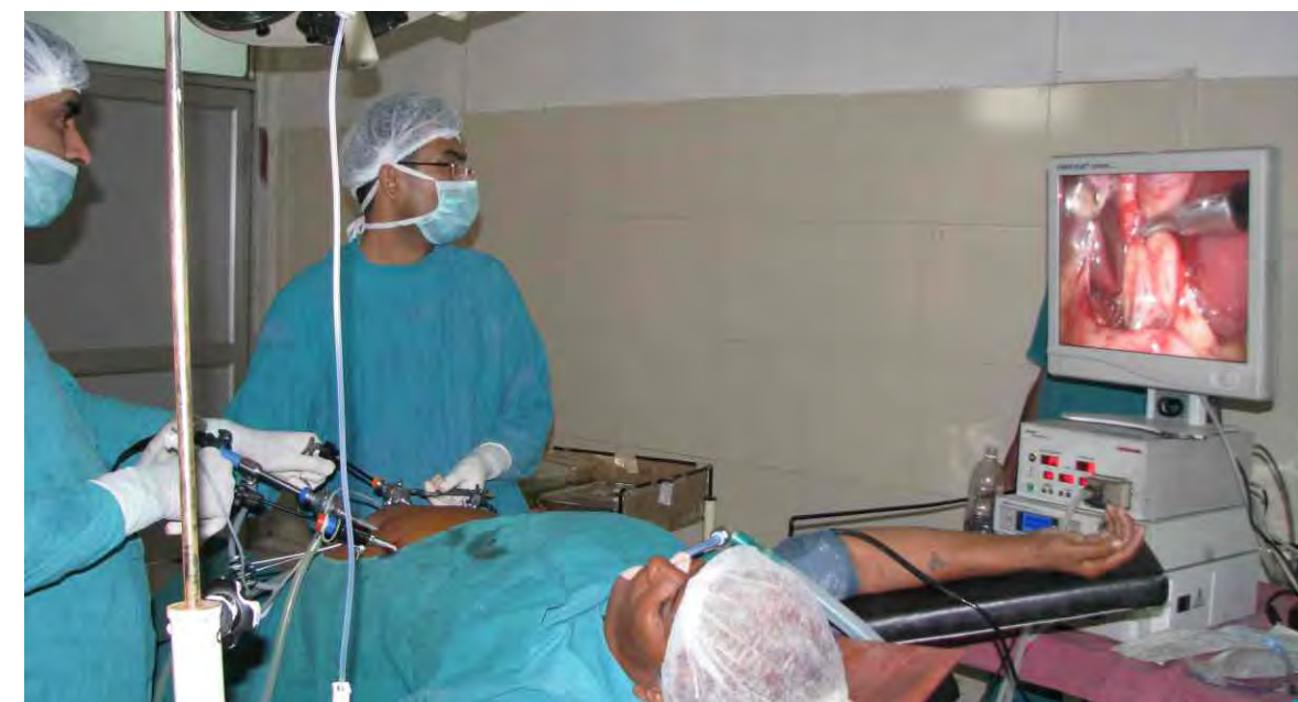
Operation under progress in the Campus Hospital

All the departments of medicine required to be taught in the BDS course are well equipped with adequate labs, museums and other paraphernalia. The faculty of medical sciences is also of high caliber and credited with abundant publications of their own in their respective field.