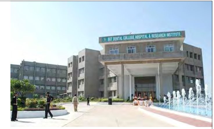
SGT Dental College, Hospital & Research Institute, Gurgaon.