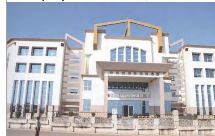
Manav Rachna Dental College, Faridabad.