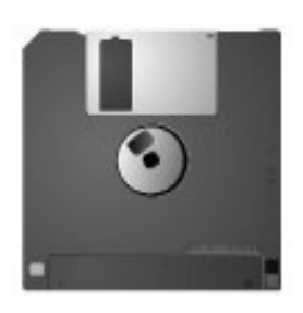
Fig. 1.4 Floppy Diskette

It is similar to magnetic disk discussed above. It is 3.5 inch in diameter. The capacity of a 3.5 inch floppy is 1.44 mega bytes. It is cheaper than any other storage devices and is portable. The floppy is a low cost device particularly suitable for personal computer system.