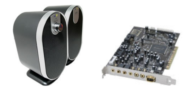
Fig. 1.7 Sound Card and Speakers