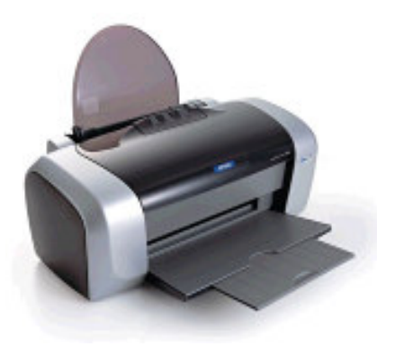
Fig. 1.5 Ink-jet Printer

Because ink-jet printers require smaller mechanical parts than laser printers, they are specially popular as portable printers. In addition, colour ink-jet printers provide an inexpensive way to print full-colour documents.