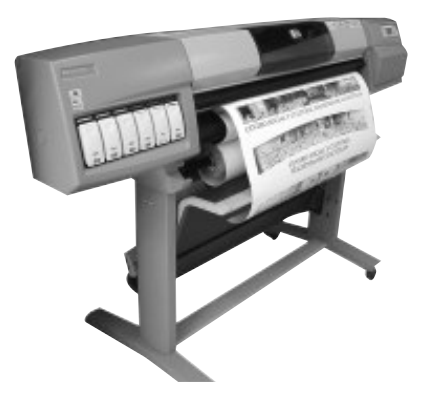
Fig. 1.6 Plotter

Plotter is a device that draws pictures on paper based on commands from a computer. Plotters differ from printers in that they draw lines using a pen. As a result, they can produce continuous lines, whereas printers can only simulate lines by printing a closely spaced series of dots. Multicolour plotters use different-coloured pens to draw different colours.