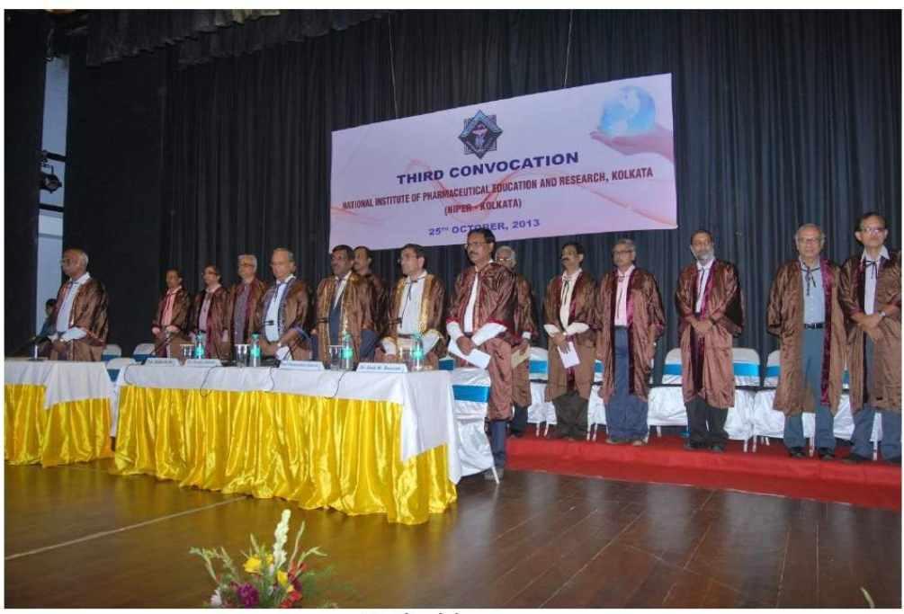
On the dais