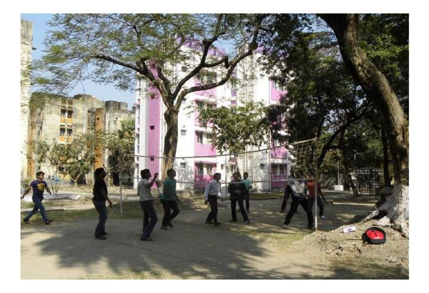
A game of volley ball in the hostel campus