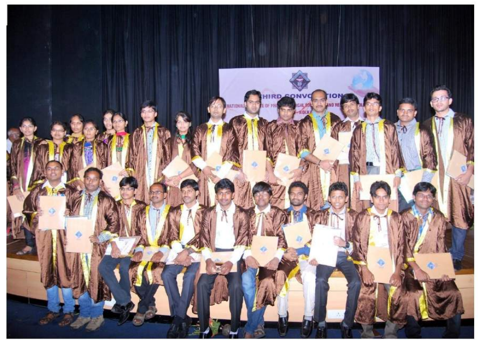
The degree recipients