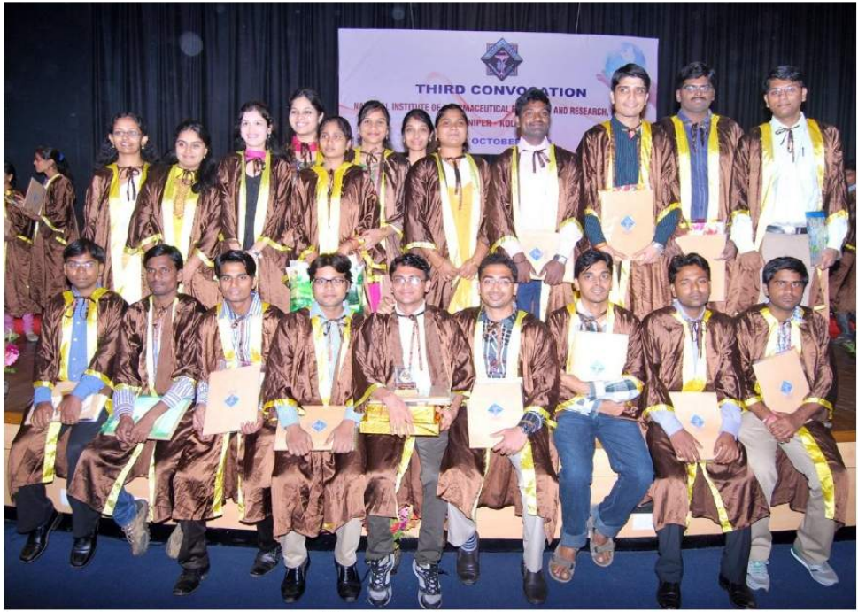
The degree recipients