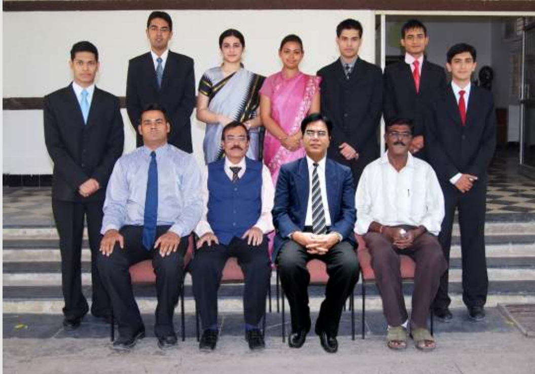
Magazine Core Committee