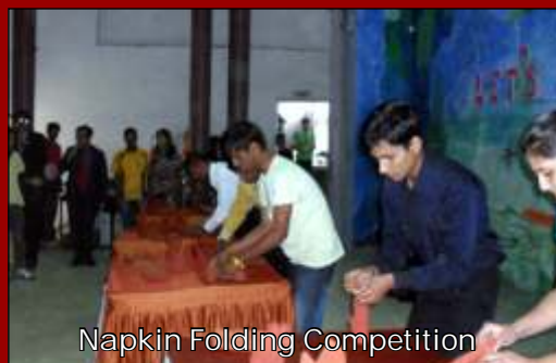
Napkin Folding Competition