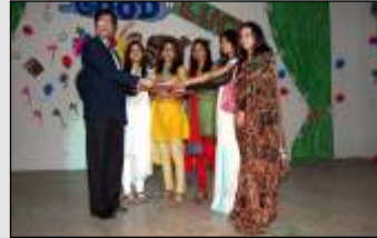
Throw Ball Team