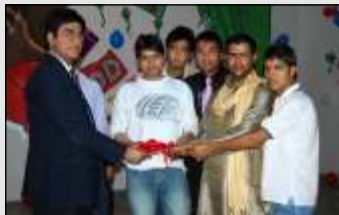
Tug of War Team