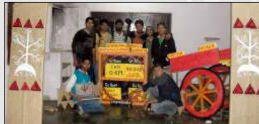
Artists who added colours