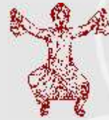
Red Carpet Welcome