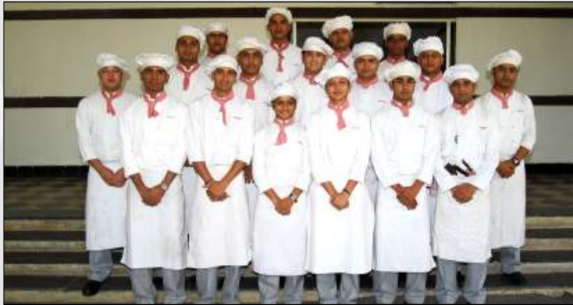
Food & Beverage Service Group ▼