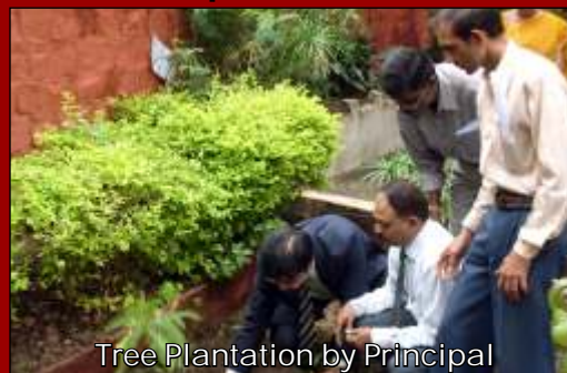
Tree Plantation by Principal