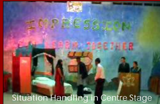
Situation Handling in Centre Stage