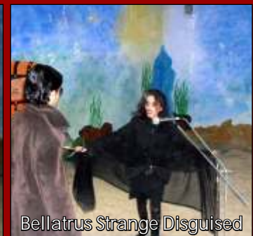
Bellatrus Strange Disguised