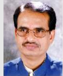
Shivraj Singh Chouhan Chief Minister