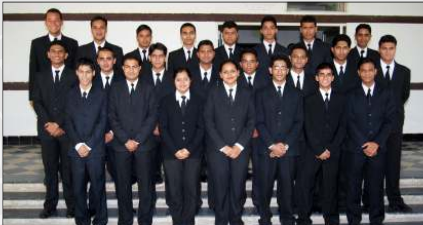
House Keeping Group ▼