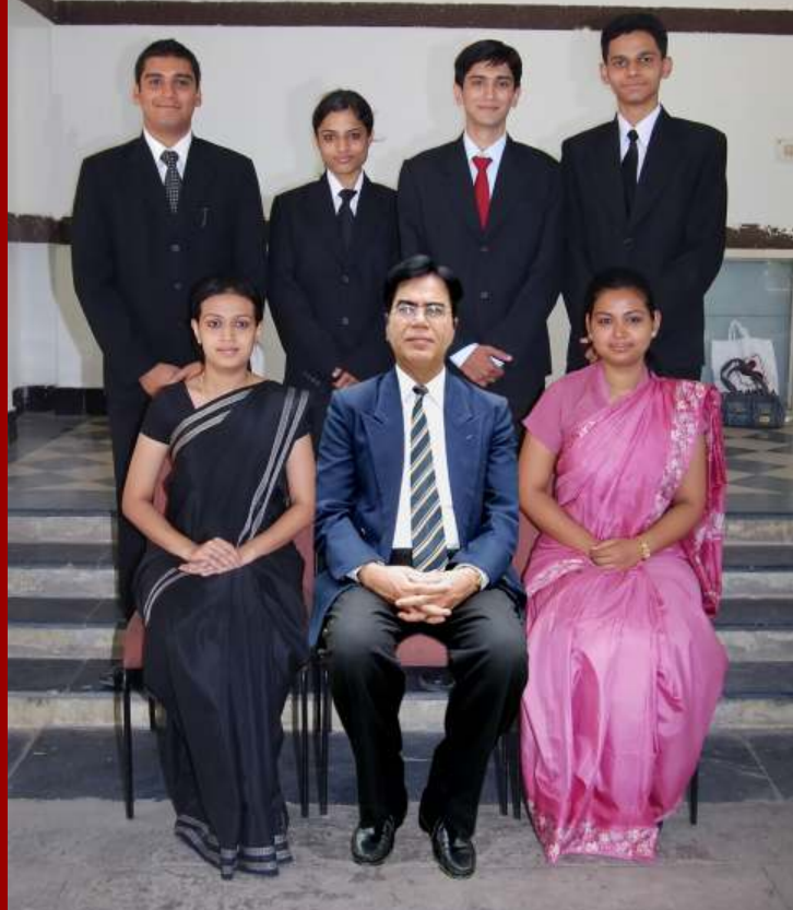
Toppers with Principal