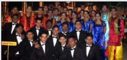
F & B Service Team