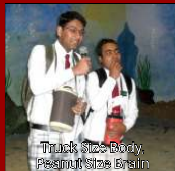
Truck Size Body, Peanut Size Brain