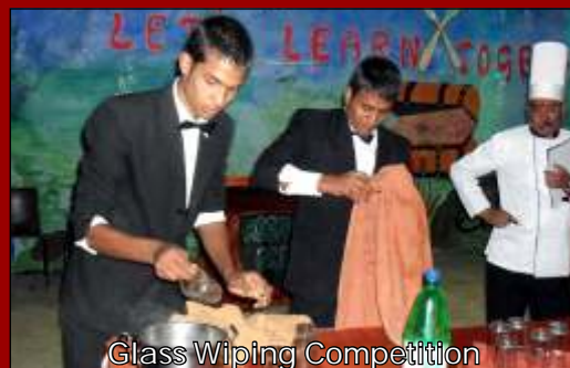
Glass Wiping Competition