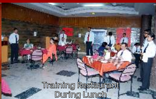
Training Restaurant During Lunch