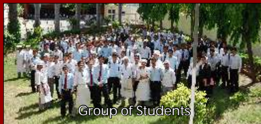
Group of Students

Group activities, both within and apart from the curriculum help create a unique bond among the students, Owing to the rapid growth of the hospitality industry in India, there is an increasing demand for trained and competent professionals within the industry. The Institute of Hotel Management, Bhopal has maintained its impeccable reputation for quality education and as a result, today finds its students placed in all the leading hotels in India and around the world.