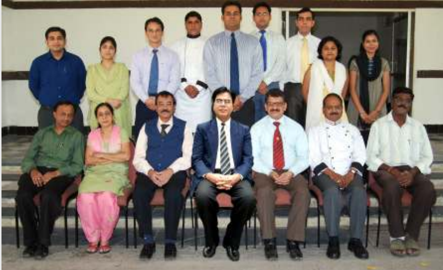
Office Staff with Principal ▼