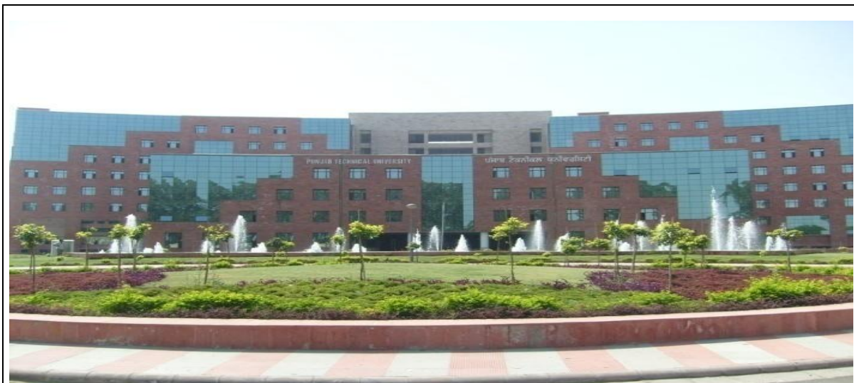
Administrative Block of Punjab Technical University