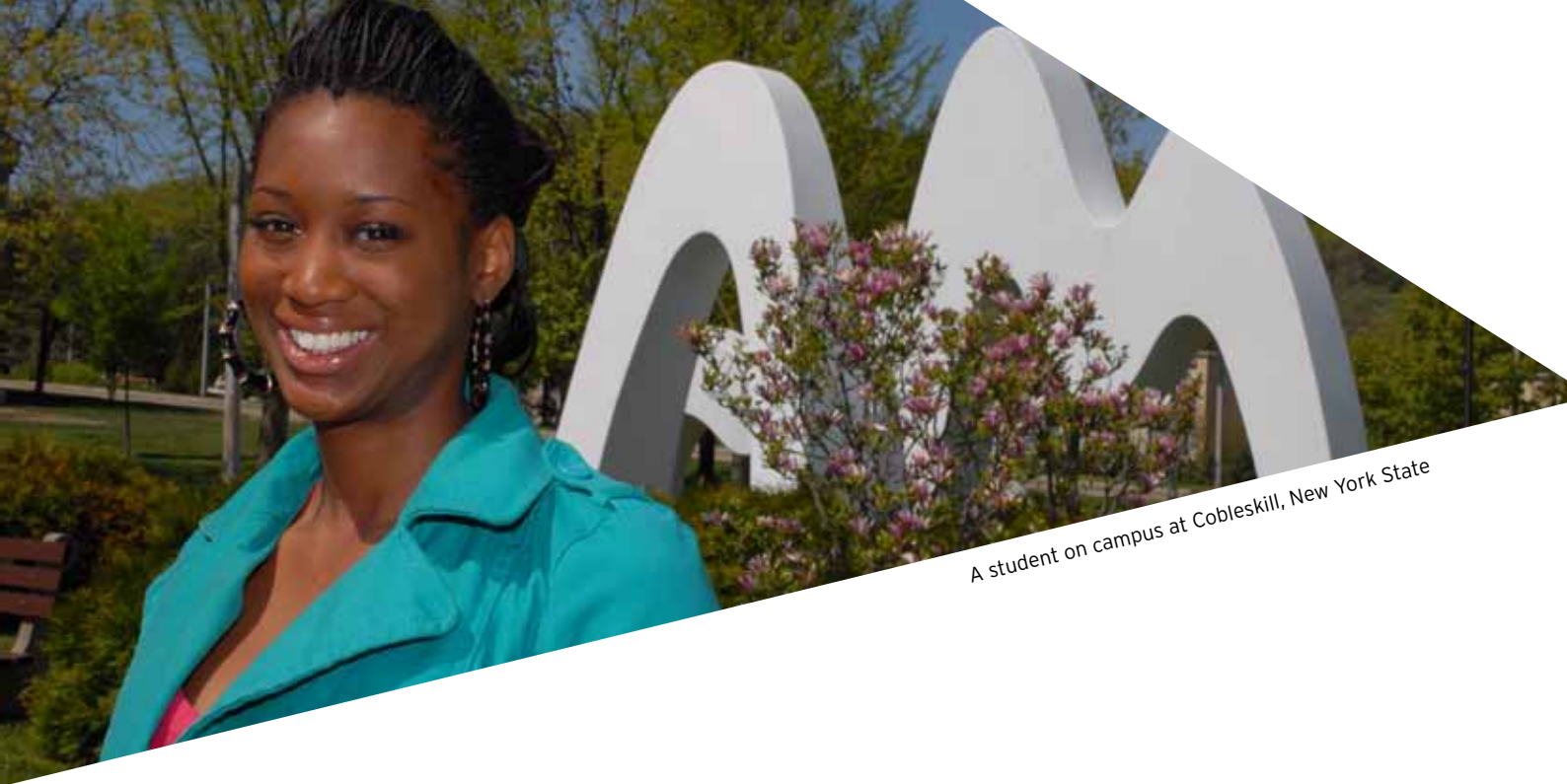
A student on campus at Cobleskill, New York State