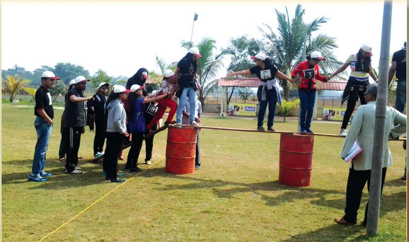
Visit to Coca-Cola and Pegasus