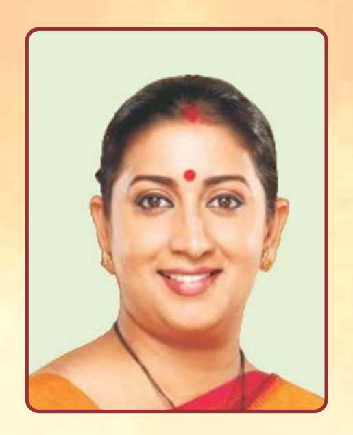
Smt. Smriti Zubin Irani Ministry of Human Resource Development Government of India