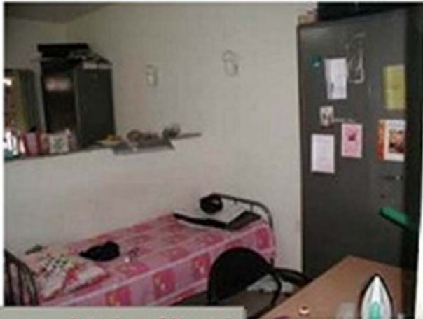
Interior of Hostel