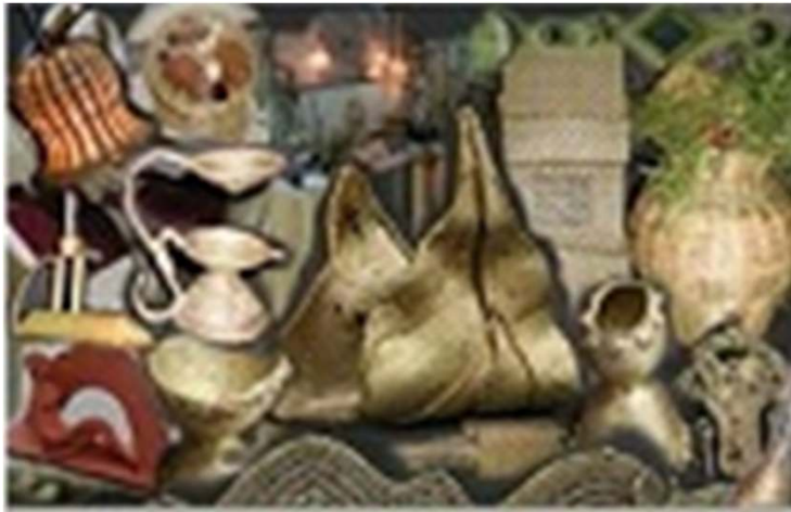
Product diversification by AD students