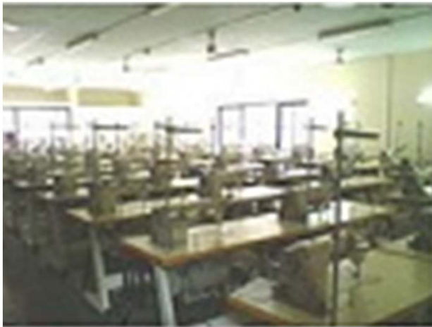
Garment Construction Lab