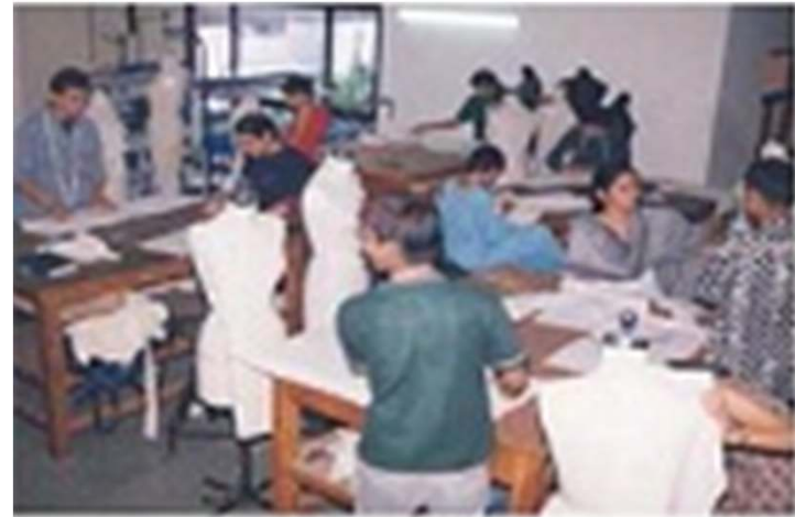
Pattern Making Lab

Design – Under Graduate Programme – 4 Yrs