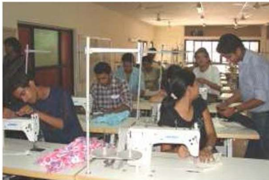
Students at Work

Technology – Undergraduate Programme – 4 Yrs