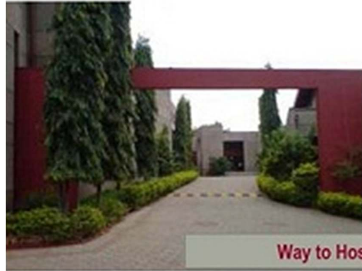
Way to Hostel