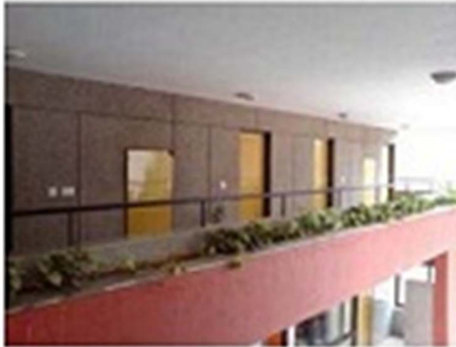
Guest rooms for the parents and guests