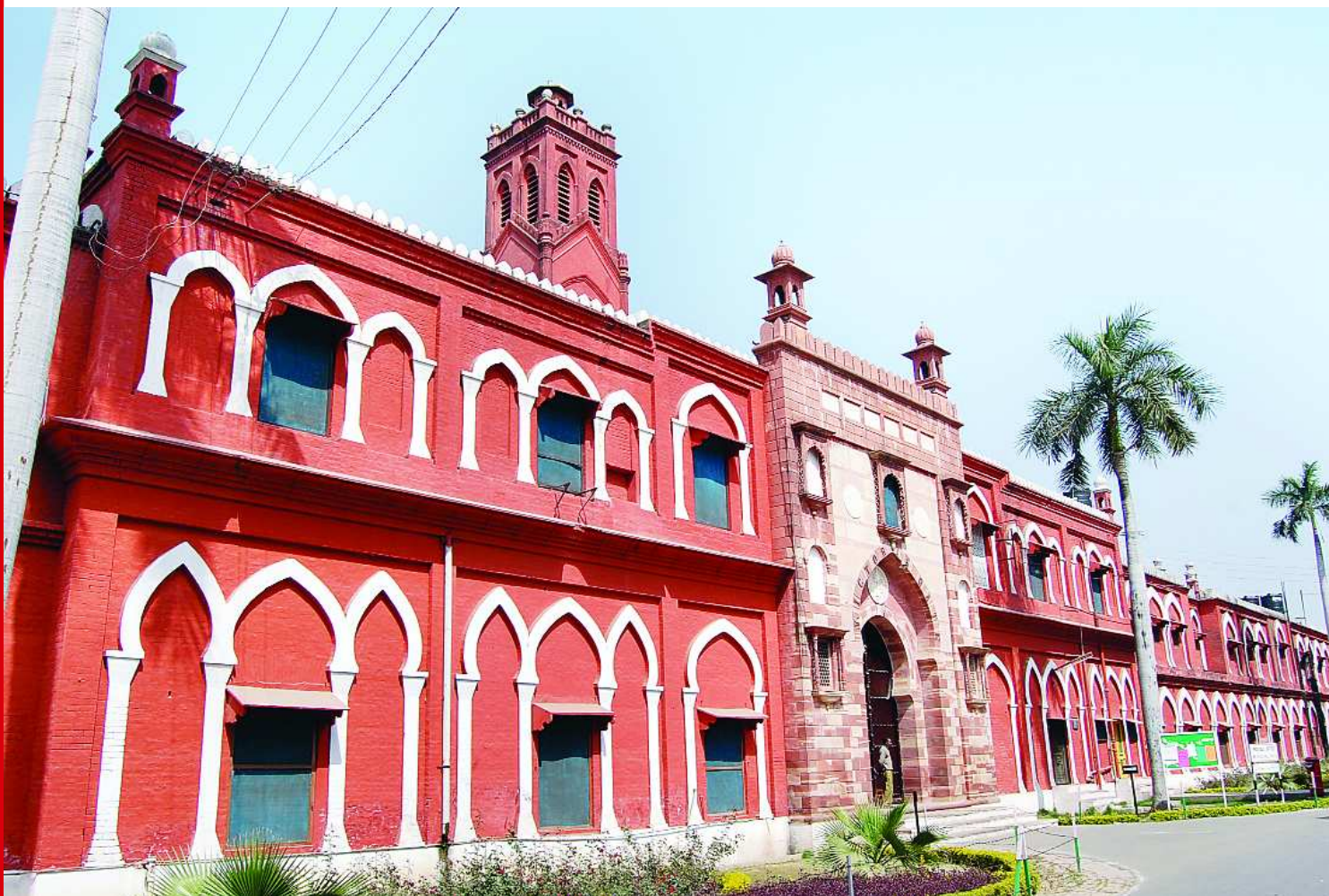
FACULTY OF LAW

It is proudly Islamic and Indian institution: a living symbol of composite culture of India and a bulwark of its secular principles.