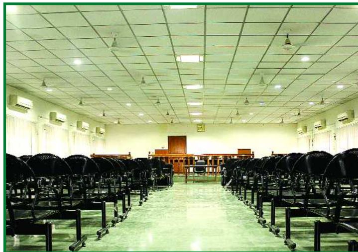
Moot Court Hall Building