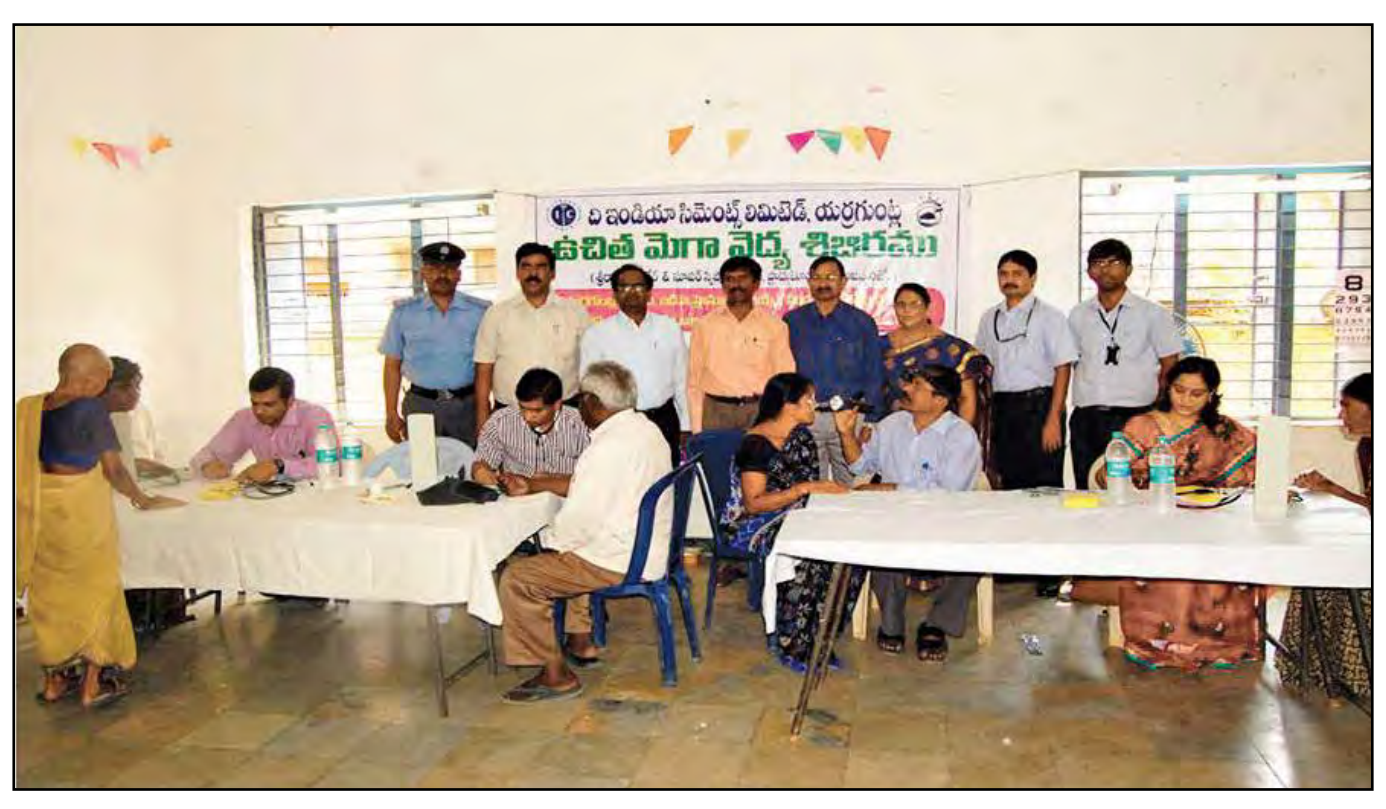
MEGA MEDICAL CAMP AT YERRAGUNTLA FOR GENERAL PUBLIC