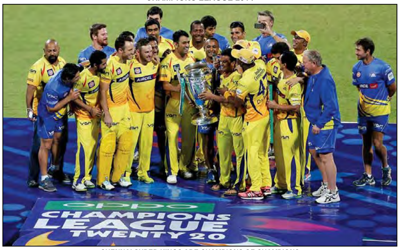
CHENNAI SUPER KINGS ARE CHAMPIONS OF CHAMPIONS