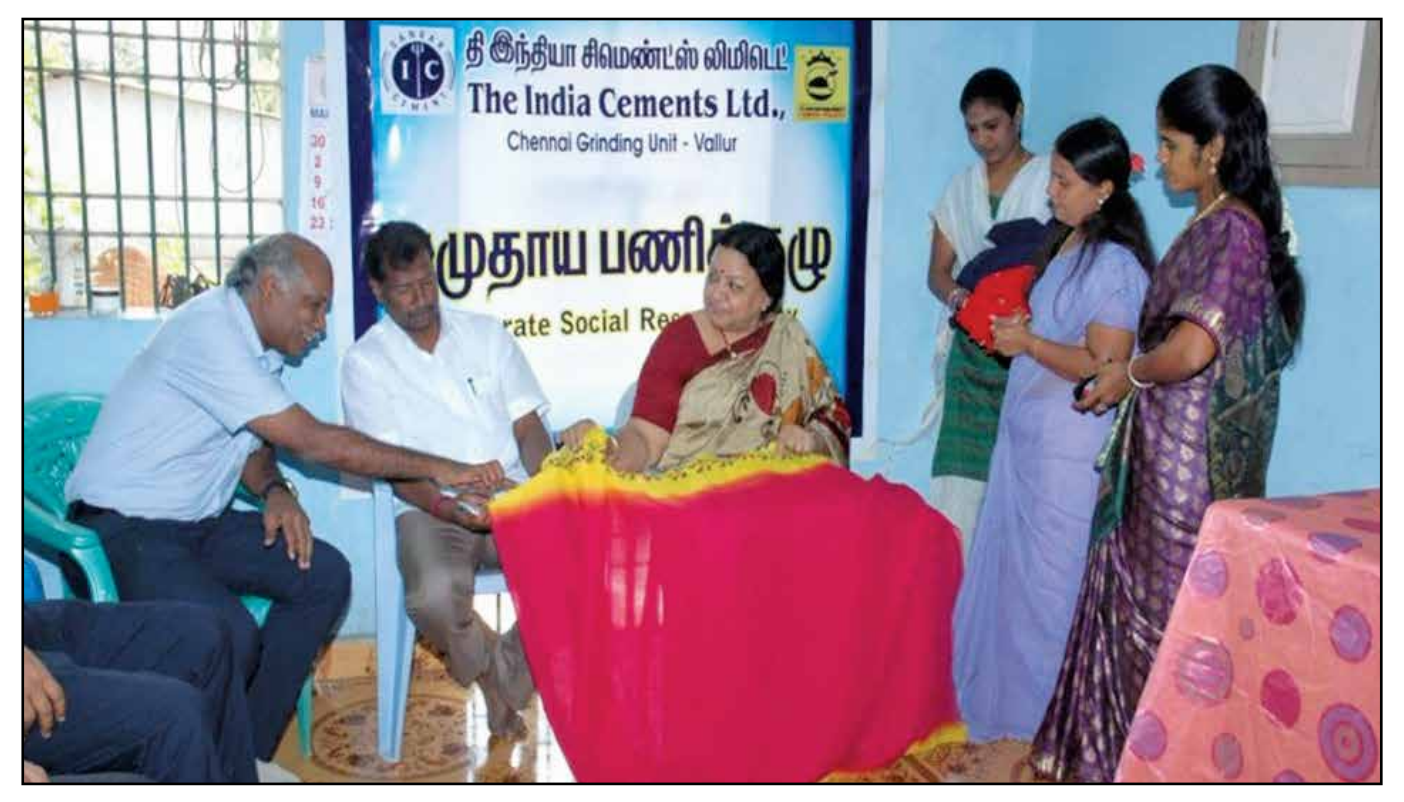
ADVANCED TRAINING IN EMBROIDERY FOR LOCAL WOMEN AT CHENNAI GRINDING UNIT