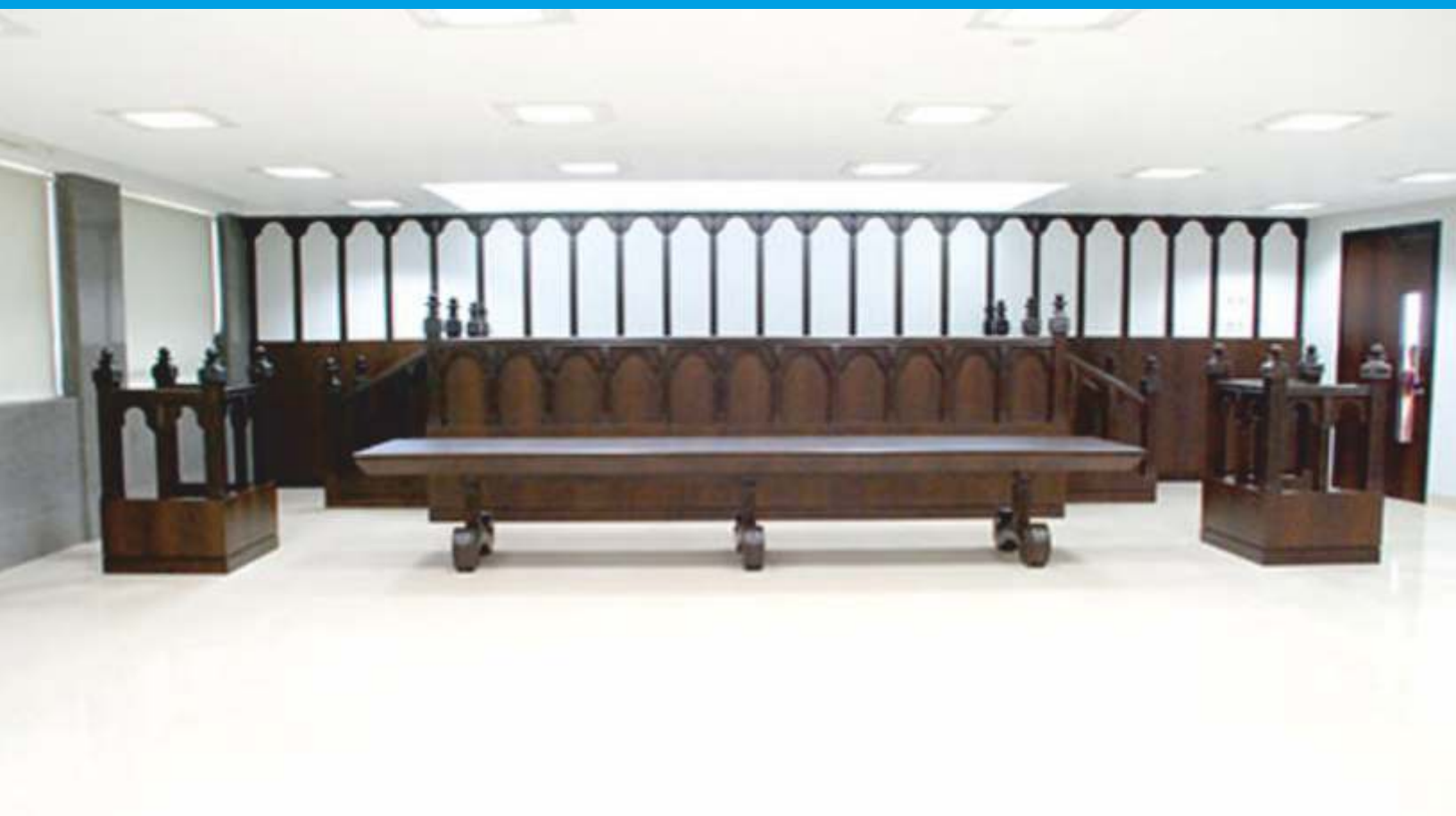
Moot Court Room