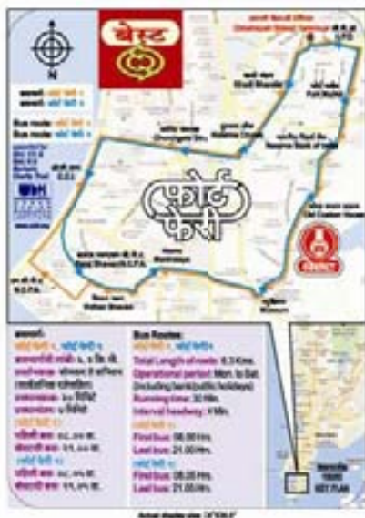
Route Map found Inside Bus