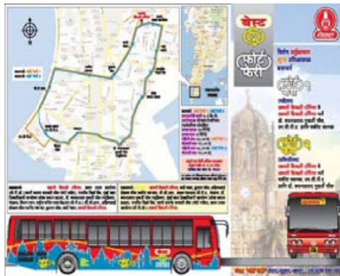
Route Map found at Bus Stop

The Fort Pheri covers CST, Ballard Estate, ShahidBhagat Singh Road, Regal, Mantralaya, Vidhan Bhavan, Marine Drive, Churchgate and DN Road.