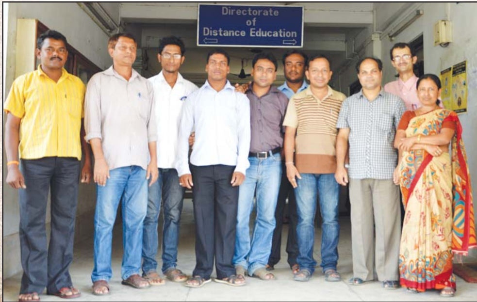
DDE Office Staff