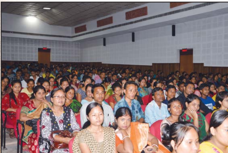
Students attending Induction Meeting 2013, organised by DDE, TU

DETAILED NOTIFICATION WILL BE AVAILABLE IN THE TU WEBSITE AND DDE NOTICE BOARD AT THE TIME OF ADMISSION. STUDENTS ARE ASKED TO INVARIABLY READ THE NOTIFICATION. MERE POSSESSION OF ELIGIBILITY CRITERIA FOR FILLING-IN OF ADMISSION FORM FOR APPEARING IN THE DEAET EXAMINATION DOES NOT ENSURE THE RIGHT TO ADMISSION TO ANY PROGRAMME UNDER THE DIRECTORATE OF DISTANCE EDUCATION, TRIPURA UNIVERSITY.