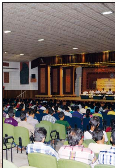
DDE Induction Meeting 2013