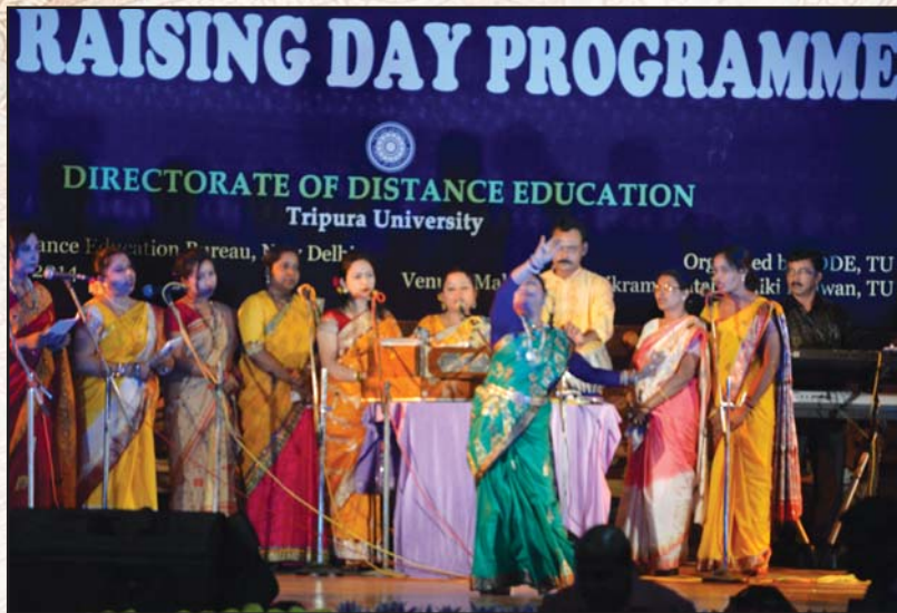
Cultural Programme by Mohana during DDE Raising Day, 2014

Each candidate shall teach at least 20 (twenty) lessons in each subject opted under Papers C1 and C2. The number of lessons in each subject taken under the same shall be governed by the provisions of the National Council for Teacher Education (NCTE) issued from time to time.