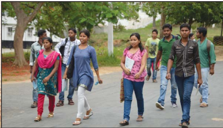
Students on the way to attend PCP Programmes of DDE, TU

Candidates applying for BEd must be in-service Teachers at Upper Primary or Middle (Classes VI–VIII), Secondary (Classes IX–X) and Senior Secondary (Classes XI– XII) levels and possess at least 2 (two) years teaching experience in Government/ Govt. Aided/Unaided Recognised Schools of Tripura. Seniority and experience, and/or merit shall be given priority in selection of candidates. Teachers appointed on or after 26/07/2010 must have secured at least 50% marks at the Graduate/Post-Graduate level. The Programme is exclusively for In-Service Teachers.