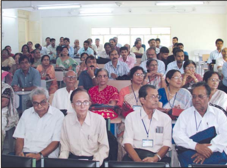
DDE Academic Counsellors during ODL Workshop-cum-Seminar (File Photo)