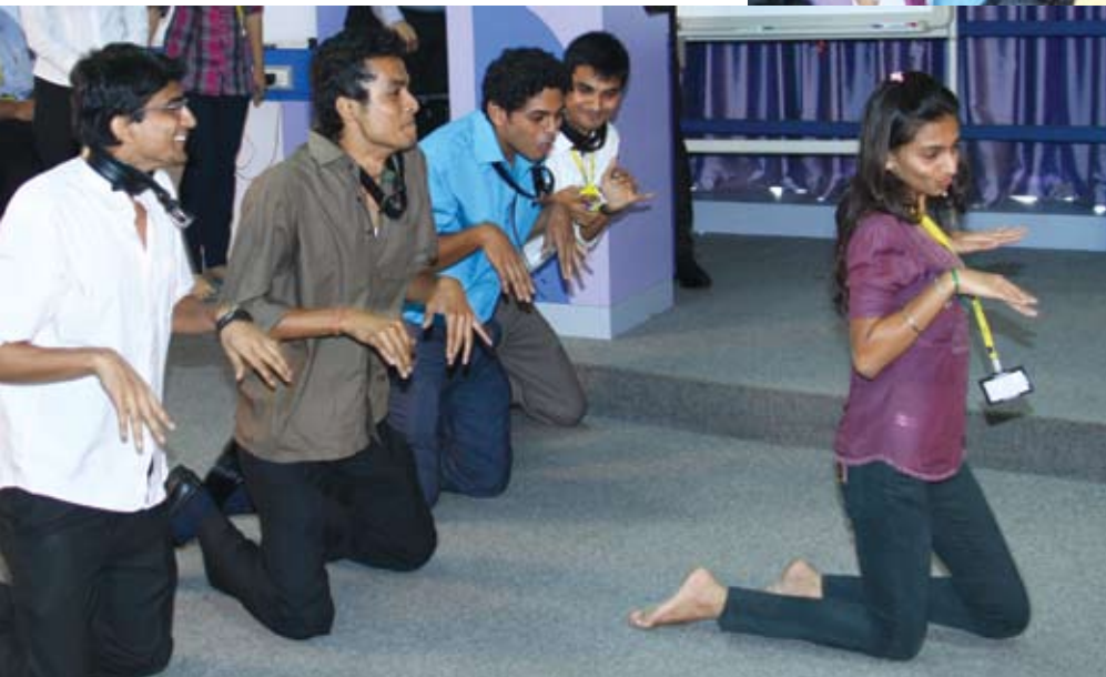
Various Student Activities