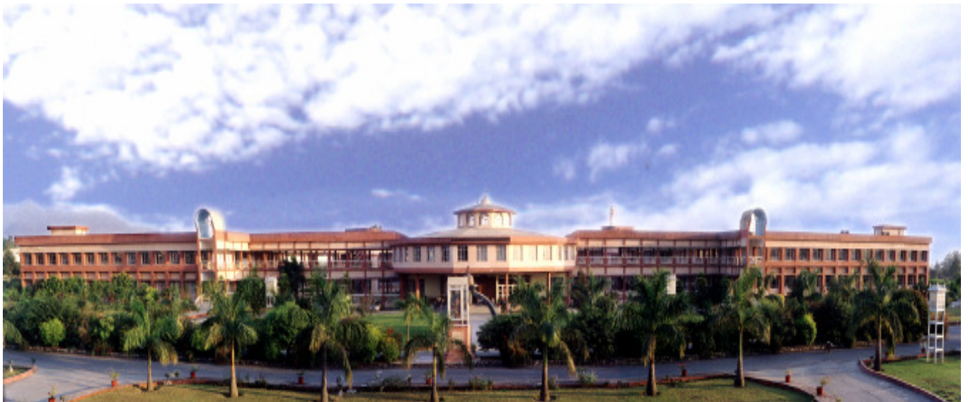
(HIMALAYAN INSTITUTE OF MEDICAL SCIENCES)