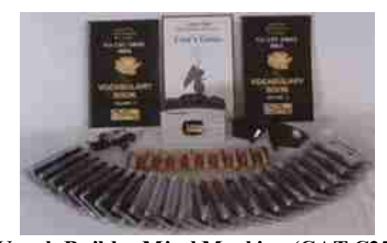
Vocab-Builder Mind Machine (CAT C25)

It consists of Mind Machine Player , ten pencil cells, 23 vocab cassettes with 4484 words and vocabulary books in 2 beautiful spiral-bound volumes.