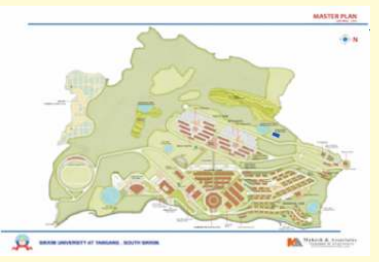
Campus site at Yangang, South Sikkim

A leading architectural firm from Chennai has been engaged to design the buildings and prepare the master plan of the campus. The campus will be fully residential with administrative cum academic complex, residential complex,