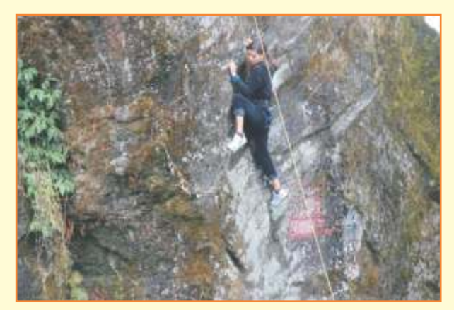
Student negotiating to climb the rock.

In addition to classroom tutelage, students of Sikkim University are encouraged to visit places of academic importance in order to gain first-hand knowledge and experience on the subjects taught. The syllabi of many of these programmes are designed to make such visits mandatory. Financial assistance is given to students for carrying out field visits and study tours as per the norms of University.