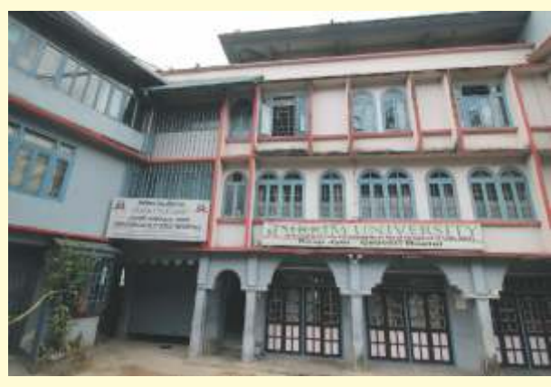
Raap Jyor Cauvery Girls' hostel.

17.1 Sikkim University has eight hostels four each for girls and boys. The hostels are located in hired premises, and the infrastructure is modest. Further expansion of hostel facilities is not possible due to difficulty in finding appropriate space and availability of wardens.