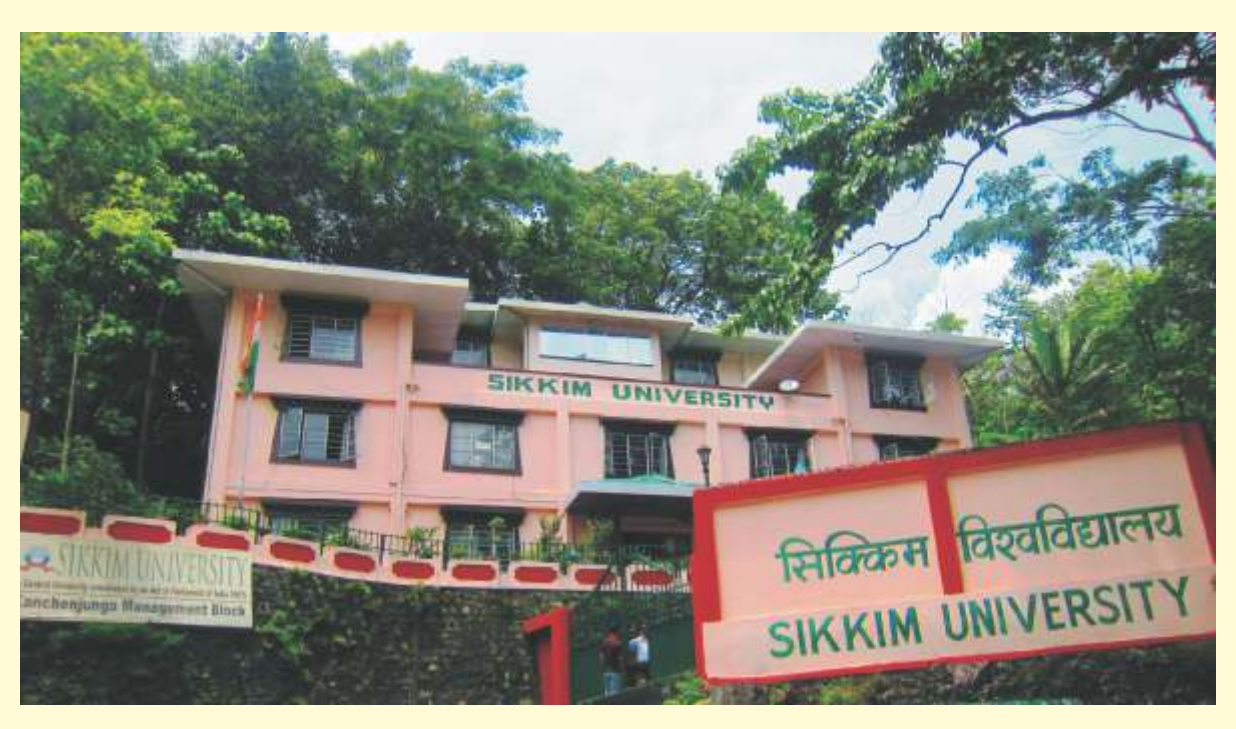
Main Administrative Building of Sikkim University 6th Mile, Samdur, P.O. Tadong Gangtok, Sikkim, 737 102 www.cus.ac.in