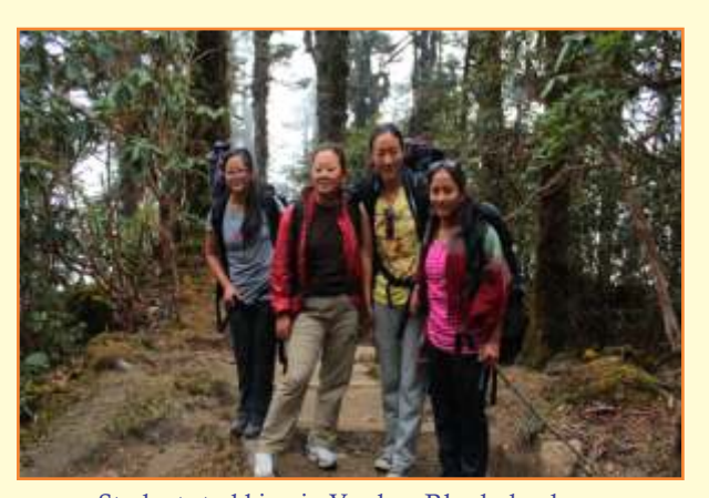
Students trekking in Vershay Rhododendron Sanctuary, West Sikkim.