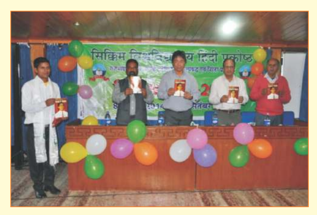
Book release on Hindi Pakhwara, September 2014.