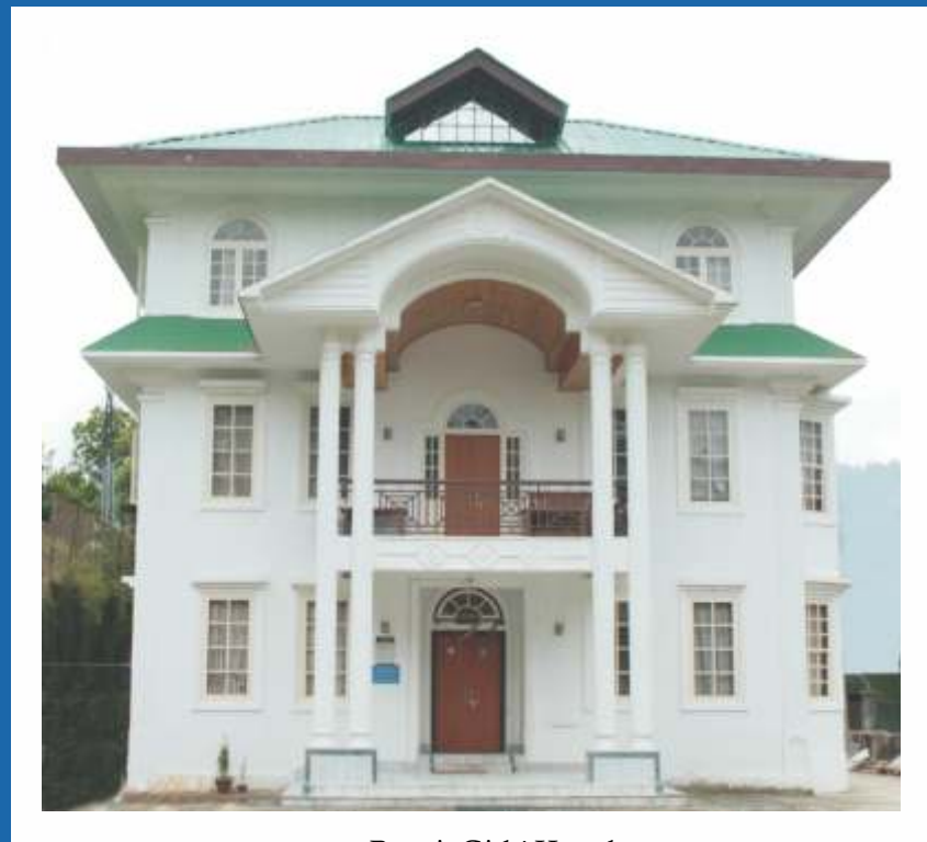
Rangit Girls' Hostel

Published by Sikkim University, 6th Mile, Samdur, PO. Tadong 737 102, Gangtok