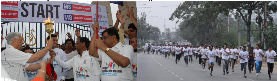
3km for Education and Urdu organized by Azad Chair & Dept. of MBA (winners of 3km run can also be seen)

Maulana Azad chair was sanctioned to the University by UGC to promote the ideology of Azad on Social, Political and Cultural aspects of India. The objective of the chair is to conduct research activities on the Azad's personality and his contribution to national integration and the field of education.