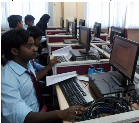
Students of MBA at Computer Lab

Department of Management was established under the School of Commerce and Business Management with the introduction of MBA program in the academic year 2004-05. Apart from the regular Management subjects which are an integral part of any management course emphasis is laid upon Case studies in the respective functional areas, Personality development sessions, Guest lectures by experts from industry, Seminars by the students on wide ranging topics, Management games and Industrial visits. The students also undergo internship at the end of II Semester which provides the opportunity to work closely with professionals in business field and to develop knowledge, competencies and experience related to their career goals. The program is intended to develop an understanding of industry and acquire skills for career development of students.