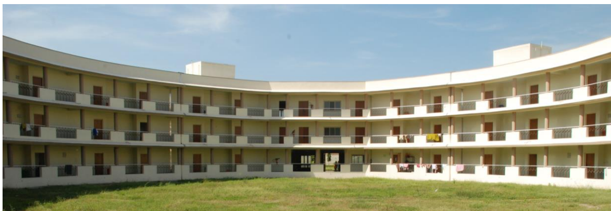
Girls Hostel (Old)

The Urdu University provides hostel facility in the University Campus for both male and female students for campus based programs. There are 3 hostels on the campus, of which 2 are for men and 1 is for women. However, the hostel facility is regulated by "Rules and Regulations" (please refer University website). As hostel accommodation available is limited, mere admission in any of the University Programs does not entail a right to admission to the University Hostels. It shall be the prerogative of the University authorities to frame the rules and regulations periodically for hostel admissions by assessing the availability of seats in each hostel. The hostel will be allotted to the students based on the Admission Procedure given below, when they apply for accommodation with sufficient documentary proof.