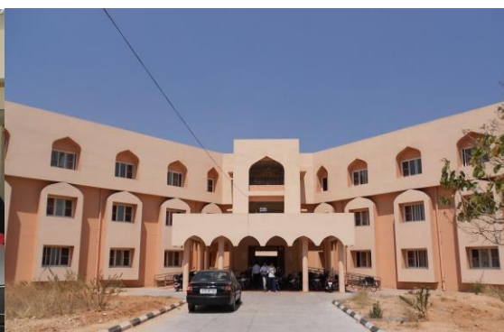
New Boys Hostel