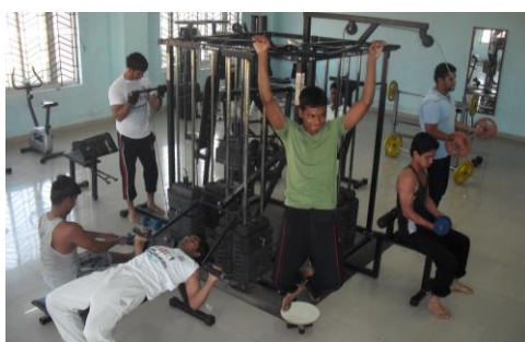
A glance at Gymnasium

The University has good infrastructure for Games and Sports. The facility has well equipped indoor stadium accommodating fitness center and indoor games like shuttle, badminton, table tennis etc. The University promotes sports and games culture among the student community by organizing coaching camps for various sports and games for the University teams. Track and field for athletic events; cricket ground and volley ball facilities are also available.