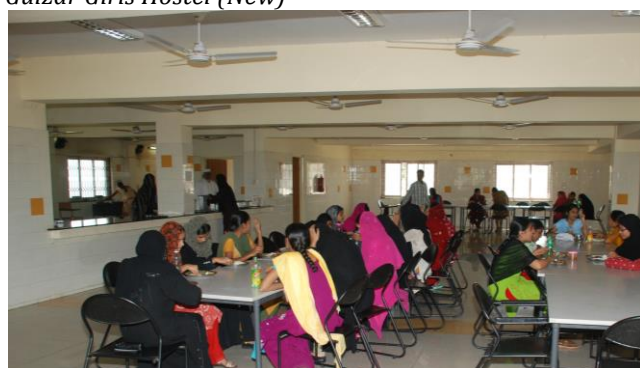
Dining Hall (Girls Hostel-Old)