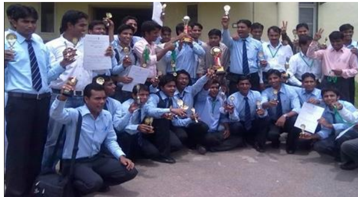
Management Fest 2014

The Department also offers research programs in Management Studies; M Phil and PhD. The research program promotes innovation, focuses on activities that can make a difference to problems that matter to industry and society and has a business-friendly attitude to foster external collaborations. The Department research focus is on four major areas namely Marketing Management, Financial Management, Human Resource Management and General Management and has a highly supportive research environment that nurtures and develops future generations of young researchers. The faculty of the Department is well experienced in facilitating the students with strong academic and research background.