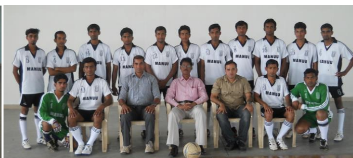
University Foot Ball Team