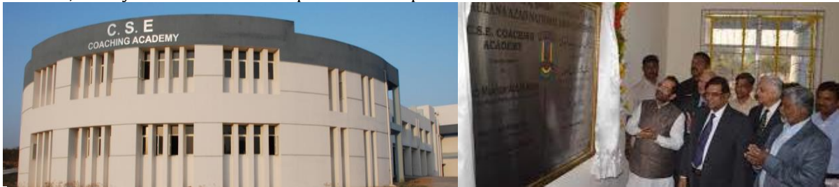
Inauguration of CSE Coaching Academy building

The Center provides coaching facilities, testing and evaluation to enable the aspirants to succeed in various competitive examinations for recruitment to services under the central & state governments, public & private undertakings etc. The Center offers coaching facilities for admission to a variety of professional courses, communication skill and personality development. The facility provides study material, library and hostel for the aspirants of competitive examination.