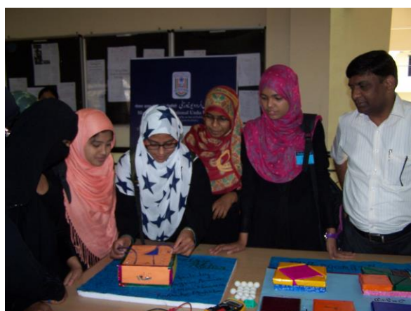
Science day celebrations

The School of Sciences was established in the year 2006. The school currently has five departments viz., Department of Mathematics, Physics, Chemistry, Zoology and Botany. The School also comprise of Polytechnics and Industrial Training Institutes (ITI) located at Hyderabad, Bengaluru and Darbhanga. The School also offers Paramedical programs. The profiles of the departments are as follows: