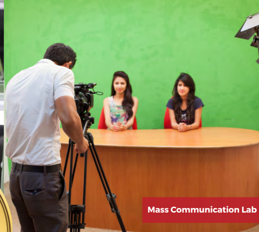
Mass Communication Lab