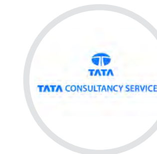
TCS Academic Accreditation for Curriculum Development, Training & Placements