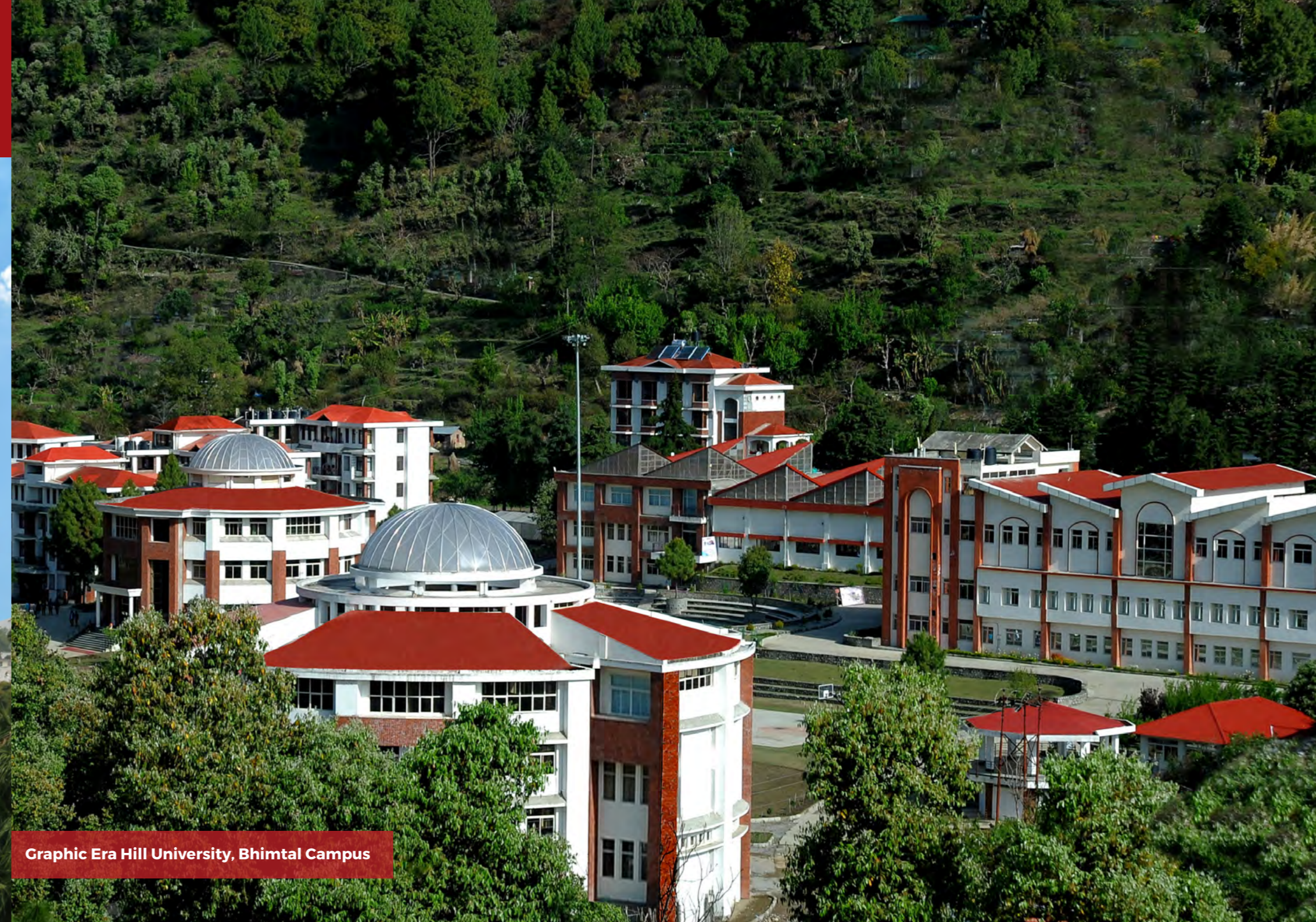
Graphic Era Hill University, Bhimtal Campus