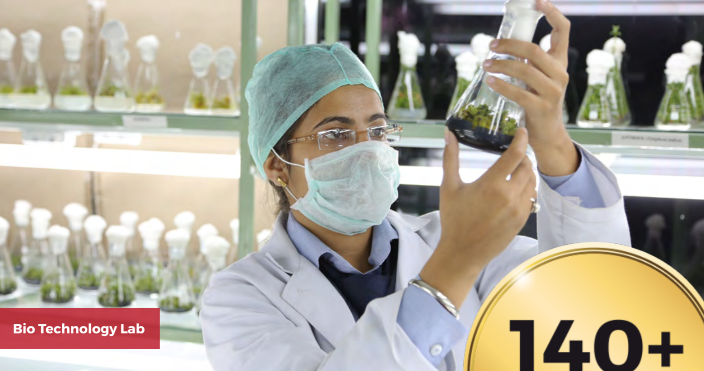
Bio Technology Lab