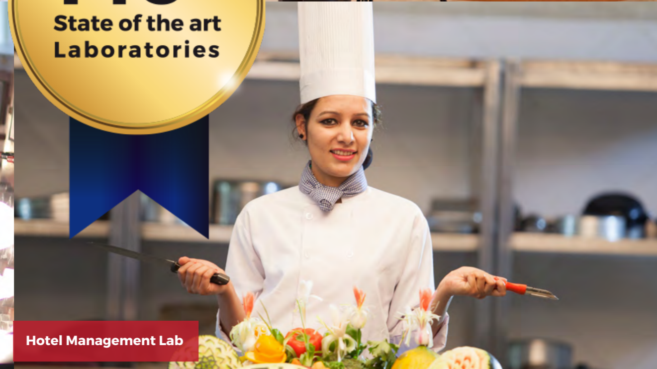
Hotel Management Lab

Graphic Era has a cluster of libraries; it connects people with information by providing diverse resources and services to the academic community.