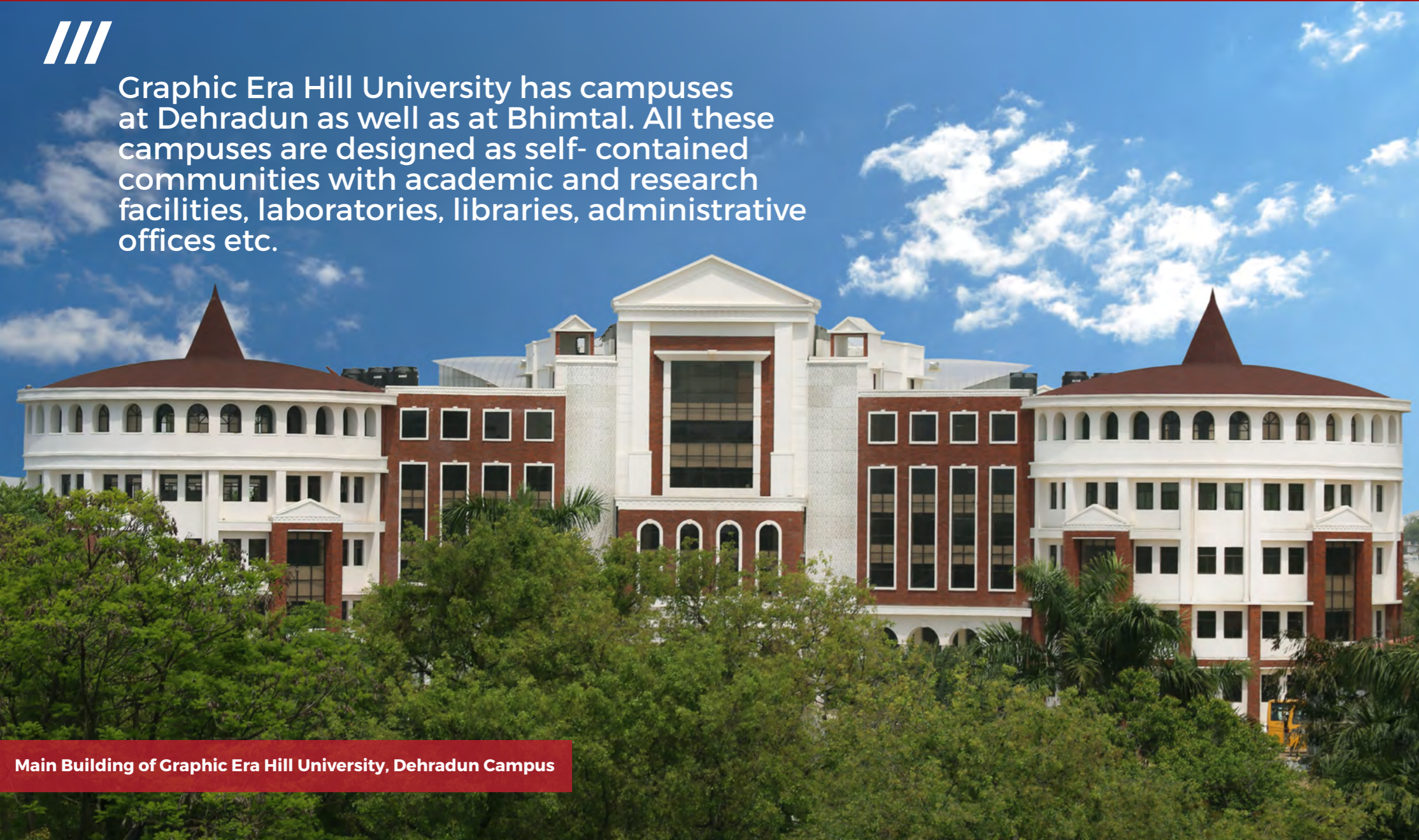
Main Building of Graphic Era Hill University, Dehradun Campus

Graphic Era Hill University has campuses at Dehradun as well as at Bhimtal. All these campuses are designed as self-contained communities with academic and research facilities, laboratories, libraries, administrative offices etc.