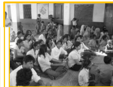
Service at Bhutpura