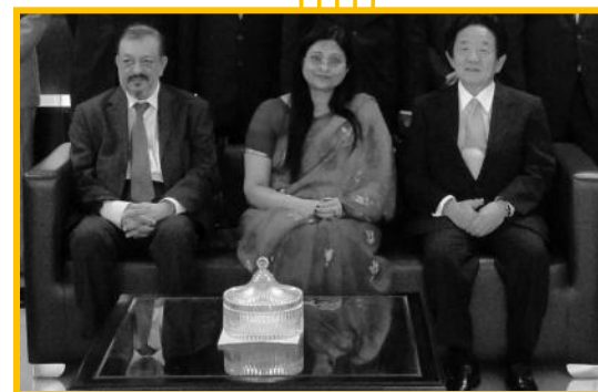
Chancellor,SPSU with Vice President of SPSU and President of Chiba University,Japan