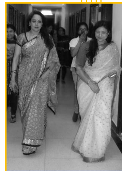
Hema Malini with SPSU Vice President