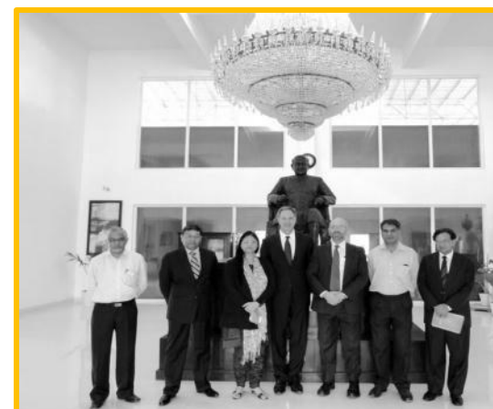
Visitors from University of California at SPSU