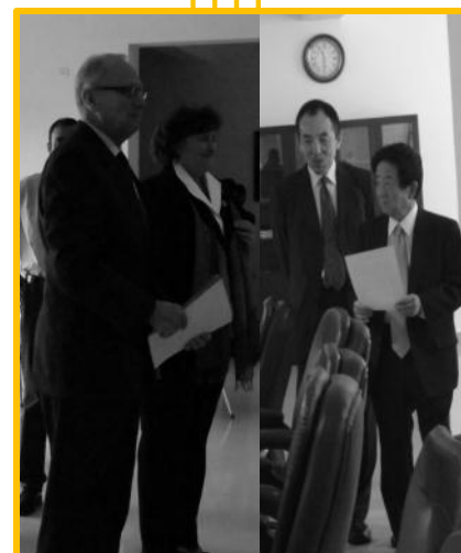
Guests of Honour