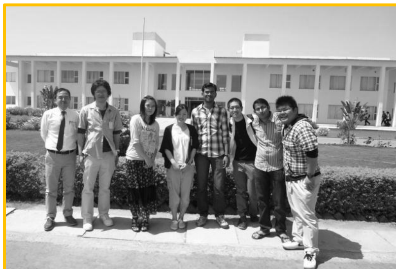
Exchange Program For Students of Chiba University Of Commerce

Selected SPSU students spend between ten days up to one full semester in some of our partner institutions.