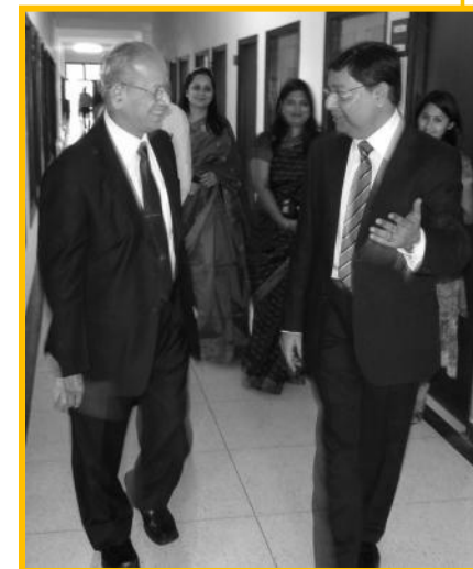
E. Sreedharan with SPSU President

Pass M.Sc/ M.Tech/ M.E in the respective discipline or in any other allied/related discipline with 55% marks or 5.5 CGPA (45% marks or 4.5 CGPA for ST/SC candidates)