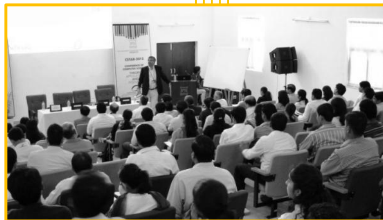
CSTAR Conference 2012 at SPSU