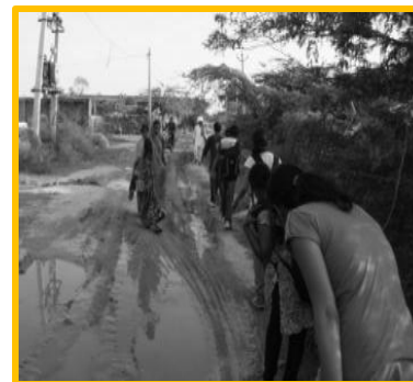
Survey of Village Pond