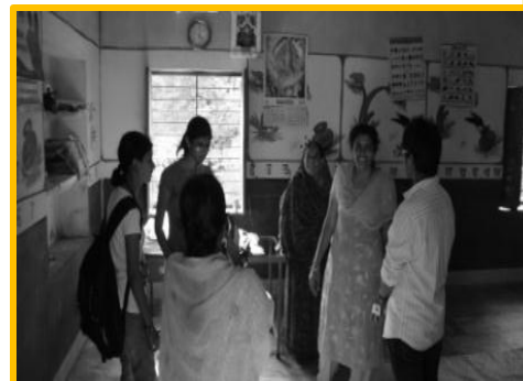
Service at Bhatewar School