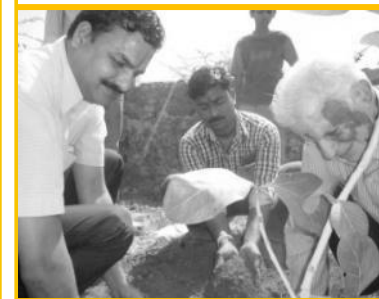
Tree Plantation at Khalatod