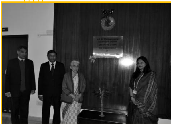
Dr. Shrimati Kamla Her Excellency The Governor of Gujarat at SPSU