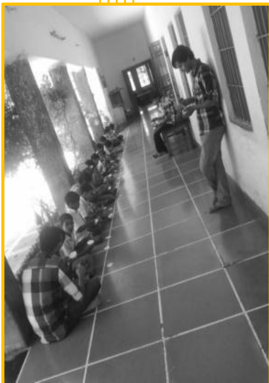
Service at Child Care Centre

Under this, 10 days camp organized in the adopted villages with a specified theme being given by Govt. of India by involving local youth.