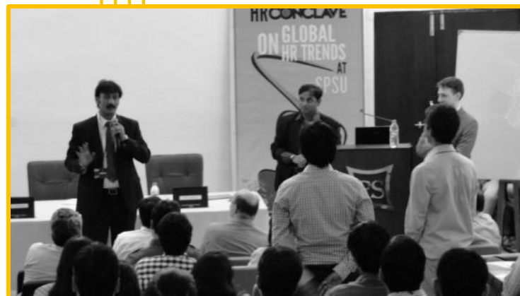
HR Conclave 2012 at SPSU