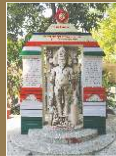
अय रम्य आम्र वृक्ष धनभाग्य हे क्या तेरा शीतल छाया मे सर्जन हुआ अनेरा