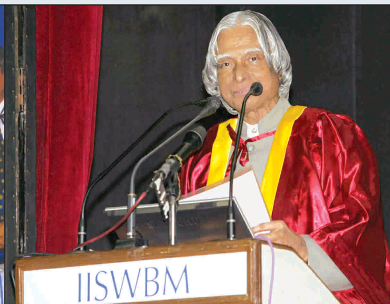
Hon'ble Dr. APJ Abdul Kalam the then President of India at the Institute's Convocation in 2006