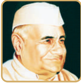
Late Babu Banarasi Das Ji (8th July 1912 to 3rd August 1985)

Chief Minister of Uttar Pradesh Govt. of Uttar Pradesh and a Great Freedom Fighter