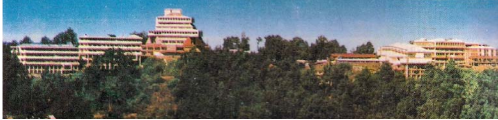
A VIEW OF H.P. UNIVERSITY, SHIMLA