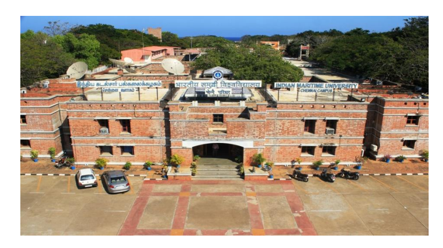
Aerial View of IMU, Chennai Campus

The IMU Chennai Campus is located at short distance (about 25 KM.) from the Metropolitan City of Chennai, on the picturesque East Coast Road on the way to Mahabalipuram. The campus is credited with ISO 9001:2000 certification and accredited with Grade 1 rating by Investment Information and Credit rating agency (ICRA).