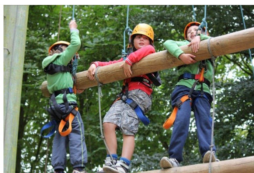
Children climbing Jacob’s Ladder at Caythorpe

Our ICT work is a strength of the school. Each year group has a set of 16 laptops to give regular access for every child to a wide range of programs and ICT facilities. Every classroom is equipped with an Interactive Whiteboard and a digital camera to enable teachers to use the latest technology to make lessons stimulating and fun.