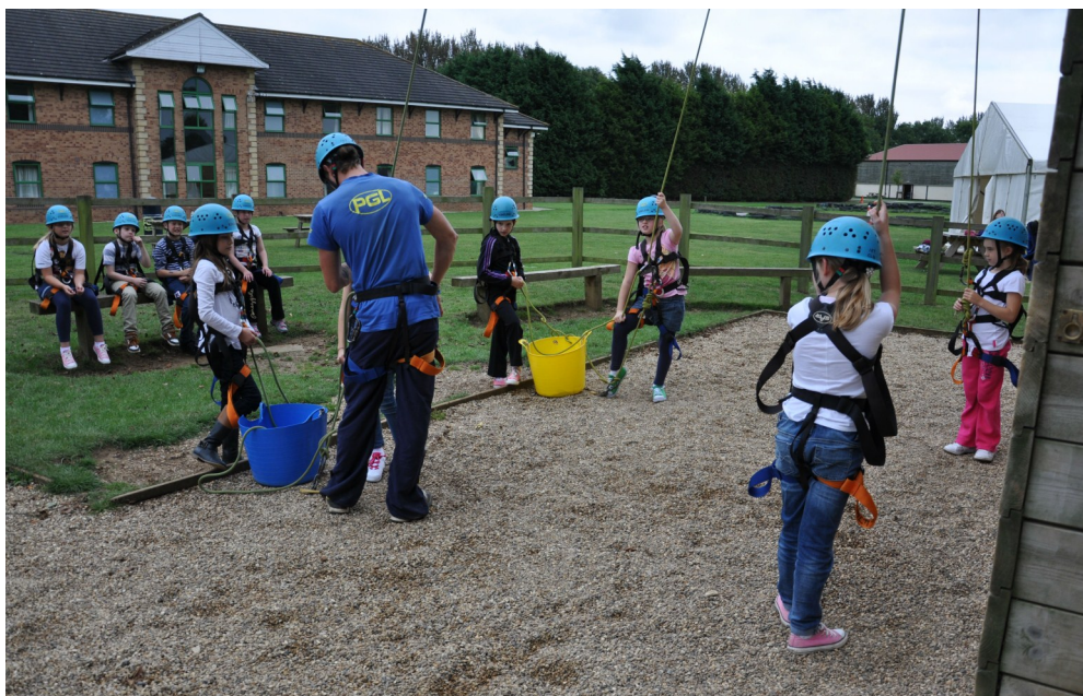
Children enjoying activities at the PGL Caythorpe Court Activity Centre - September 2013

If any parents are interested in becoming a school governor, please discuss this with the headteacher. He will tell you more about the role and when elections are due to be held.