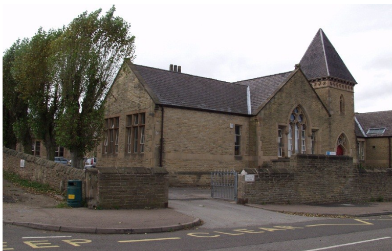
Dronfield Junior School viewed from School Lane

We are very proud of our school, which is the oldest and largest junior school in Dronfield. Built in 1875 the stone building has been modernised and extended and is now extremely well equipped and resourced. The Governors have introduced many measures to improve security to ensure your child’s safety, and the school’s playgrounds have been developed to provide a wide variety of play and sports facilities as well as quiet areas, sculptured seating, a sunshade and covered canopy area, an adventure playground and a wildlife area. Similarly there have been many measures taken to ensure disabled pupils are catered for and welcomed. If your child has any specific needs please contact the headteacher.