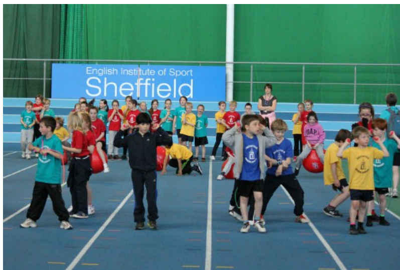
Children enjoying Sports Day at English Institute of Sport—May 2013

We are fortunate in having excellent sports facilities, including a school field with 2 football pitches and rounders pitches. Our yards have several short tennis courts and facilities for netball, 5 a side football and basketball. We make the most of these facilities with a full programme of after school sports clubs, including football, tag rugby, netball, basketball, table tennis, water polo and running. . Similarly we have excellent table tennis facilities. Various sports coaches visit the school to give children the opportunity to develop their skills to a high level.