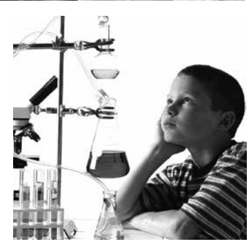
Middle School Programs