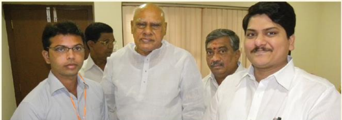
OUR 2013 JANUARY CPT ALL INDIA 1 ST RANK HOLDER IS FELICITATED BY HONOURABLE AP EX. CM & PRESENT GOVERNOR OF TAMILNADU STATE SRI. ROSSAIAH GARU