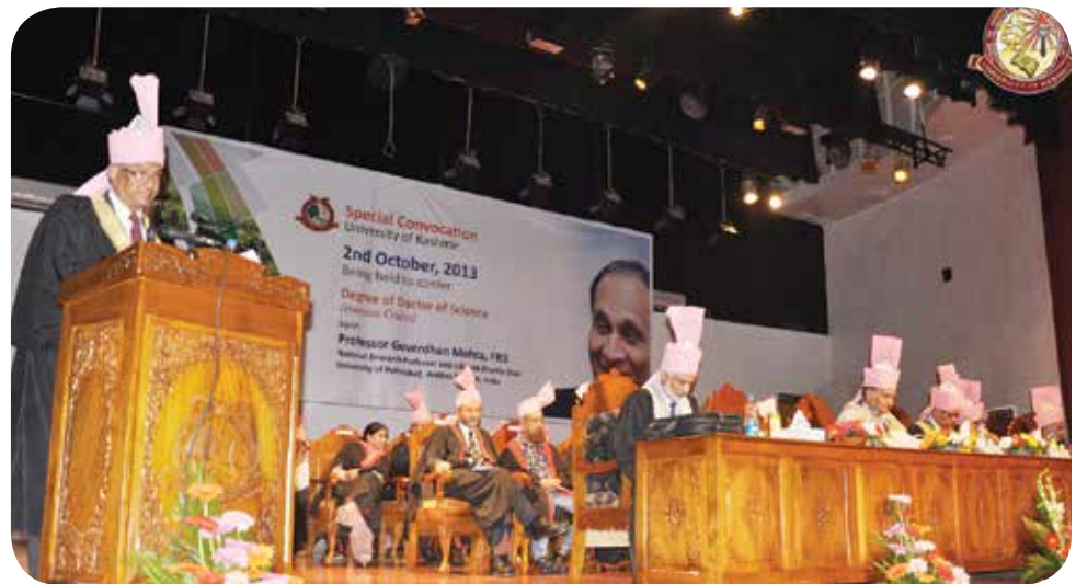
Special Convocation held to confer Degree of Doctor of Science (Honoris Causa) upon Professor Goverdhan Mehta, FRS an Eminent Scientist