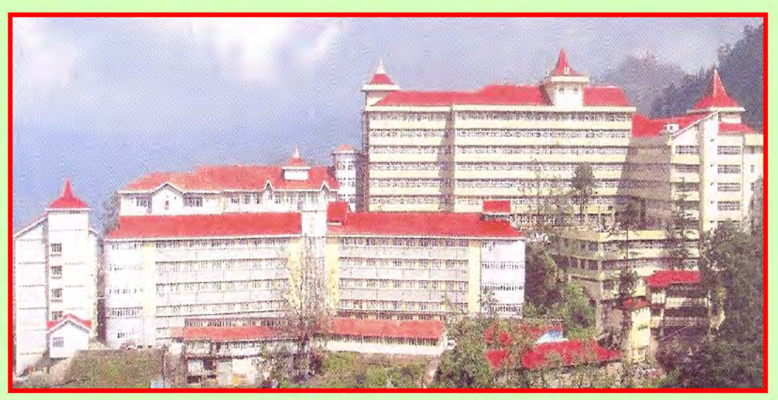
A VIEW OF I.G.M.C. SHIMLA