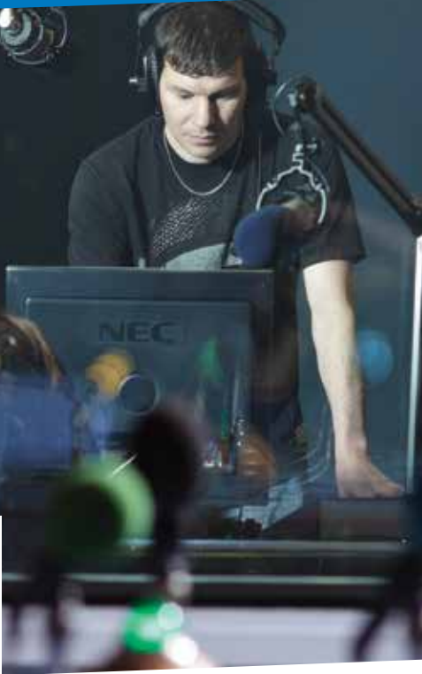
■ The recording studios at our Stenton Campus.

When it's time to hit the books you'll have the benefit of the first class learning facilities and environments within our campuses and local learning centres across Fife.