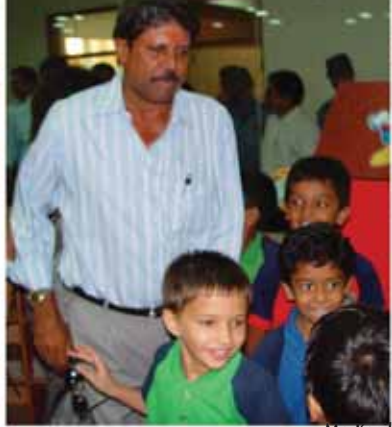
Mr. Kapil Dev with young Heritans