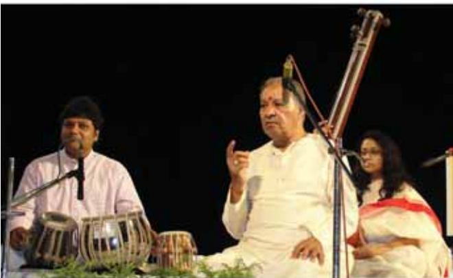
Pt. Hari Prasad Chaurasia visits The Heritage