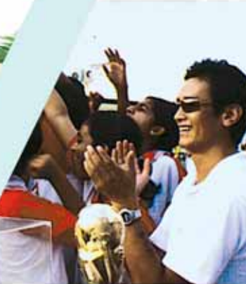
Mr. Bhaichung Bhutia at The Heritage on Sports Day