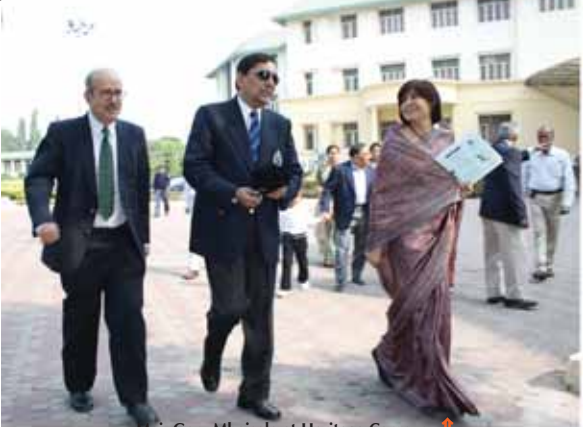
Maj. Gen. Mhaisale at Heritage Campus