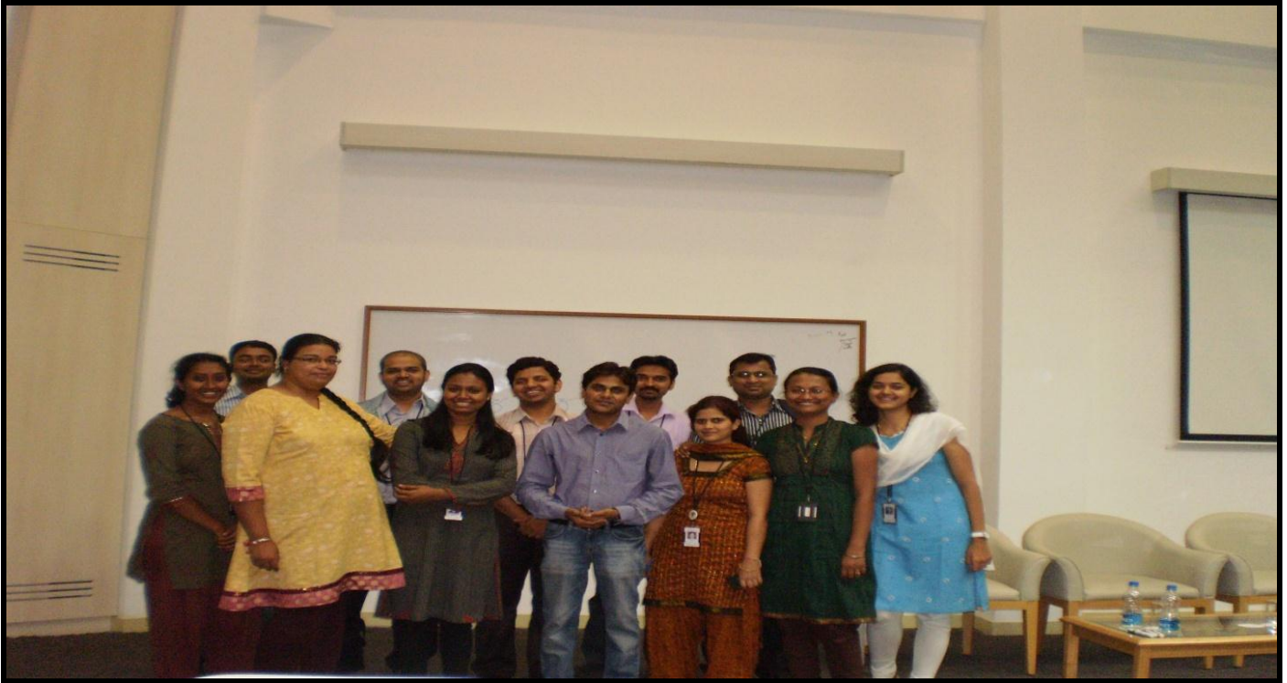
Infosys Class – Level 1