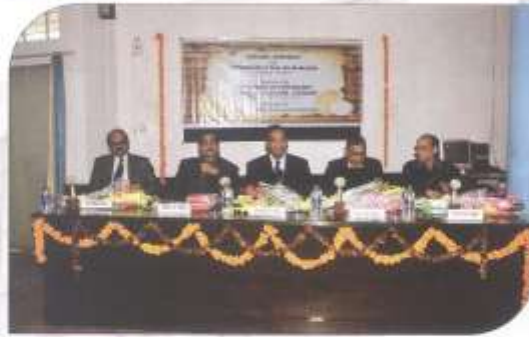
Two-Days National Workshop