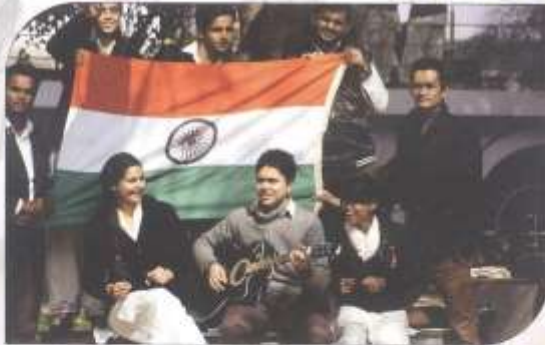
Azadi - 2013