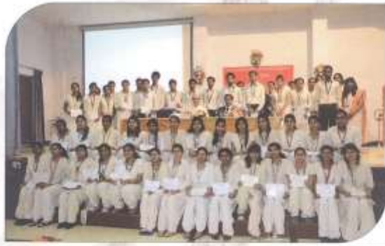
Honouring of Outstanding achievers (2013-14) by the Vice-Chancellor & the Principal