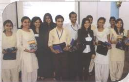
Delegates from French Embassy Promoting Education in France