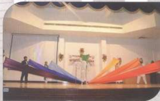
Spectrum - 2014