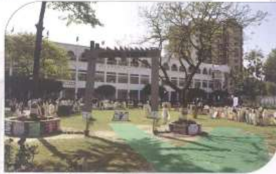
Exhibiting Entrepreneurial Collaboration