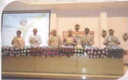
Releasing of the Souvenir during National Seminar