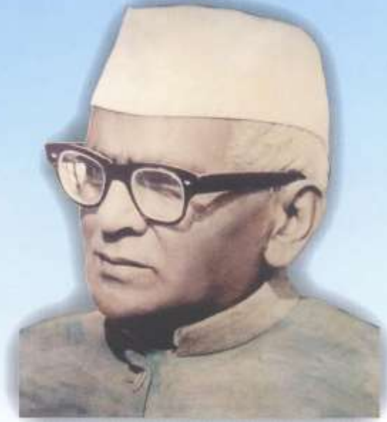
Late Sri Chandra Bhanu Gupta Ji