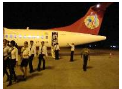
IGIA Students' returning from In-flight Training