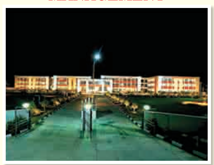
Rayat & Bahra Institute of Hotel Management, Rayat-Bahra Technology Center for Excellence, Sahauran, Near Kharar, Mohali – 140 101 (Punjab)